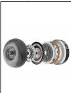
F3 Torque Converter

P/N: 46-70012 (Blk/Mach.) 46-70010 (RAW)