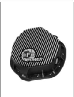
Rear Differential Cover

P/N: 46-70012 (Blk/Mach.) 46-70010 (RAW)