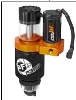
Diesel Fuel System

P/N: 42-14021 (Full-time) 42-14022 (Boost)