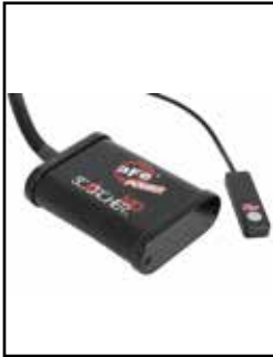
SCORCHER HD Module

P/N: 77-44005 (LB7) 77-44006 (LLY/LBZ/LMM) 77-44007 ('11-'14 LML) 77-44008 ('15-'16 LML)