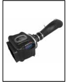
Twisted Steel Header