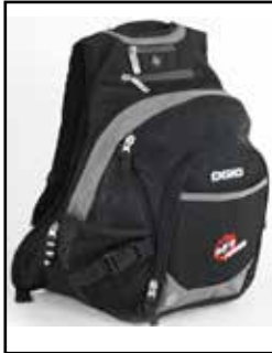
aFe Power Backpack