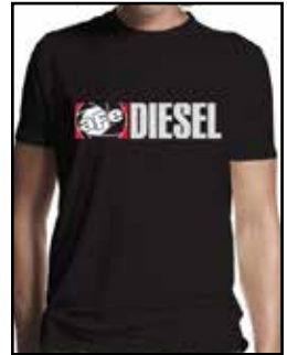
aFe Diesel Tee

P/N: 40-30221 (M) P/N: 40-30222 (L) P/N: 40-30223 (XL) P/N: 40-30224 (2XL) P/N: 40-30225 (3XL)