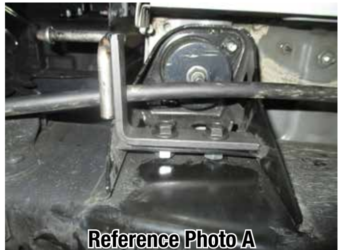
Reference Photo A