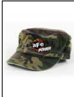
aFe Power Ladies Hat

P/N: 40-10114 (S/M) P/N: 40-10115 (L/XL)