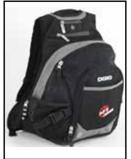
aFe Power Backpack