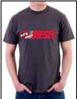
aFe Power Diesel T-Shirt

P/N: 40-30222 (L) P/N: 40-30223 (XL) P/N: 40-30224 (2XL) P/N: 40-30225 (3XL)