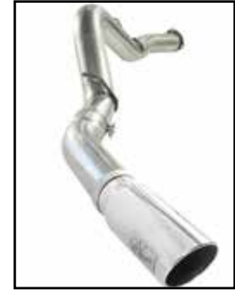
P/N: 49-44040-B (Blk. Tip) 49-44040-P (Pol. Tip)