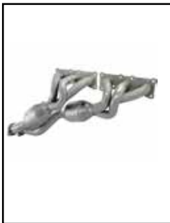
Twisted Steel Header