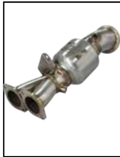
Exhaust Down Pipes

P/N: 48-36302-HC (Street) 48-36302-HN (Race)