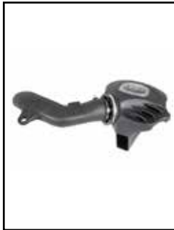
Momentum Intake System