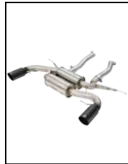
Axle-Back Exhaust System

P/N: 49-36327-B (Blk. Tips) 49-36327-P (Pol. Tips)