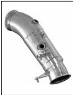
Twisted Steel Header

P/N: 48-36311 (No Cat.) 48-36310 (W/ Cat.)