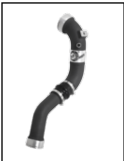
Intercooler Cold Side Tube

P/N: 49-36328-P (Pol. Tips) 49-36328-B (Blk. Tips)