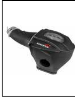
Momentum Gt Intake