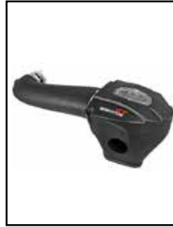
Momentum Gt Intake