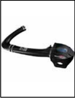
Momentum Gt Intake