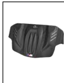
Dry C/F Engine Cover

P/N: 49-36317-C (C/F Tips) 49-36317-P (Pol. Tips)