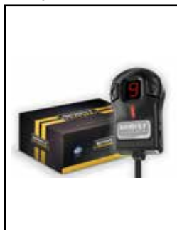
Sprint Booster V3