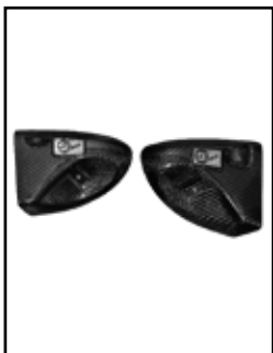
Dynamic Air Scoops