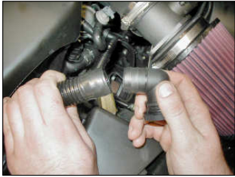
Fig. # 13