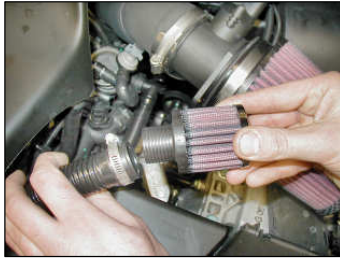
Fig. # 14