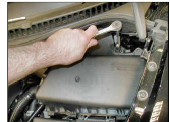
Fig. # 4