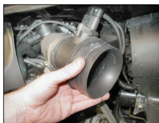
Fig. # 11