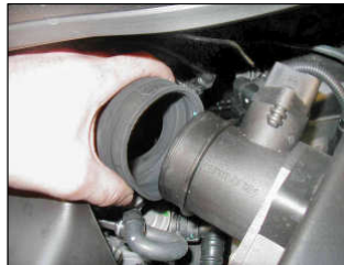
Fig. # 3