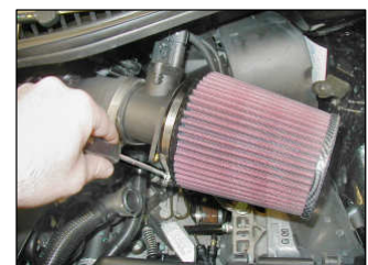
Fig. # 12