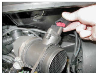
Fig. # 10