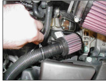
Fig. # 15