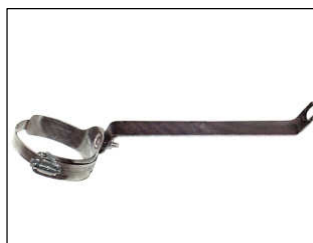
Fig. # 7