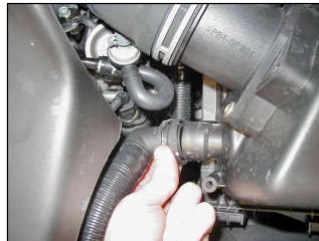
Fig. # 2