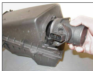
Fig. # 6