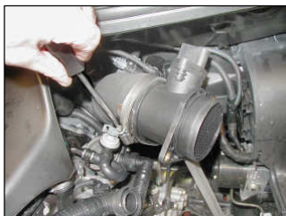
Fig. # 9