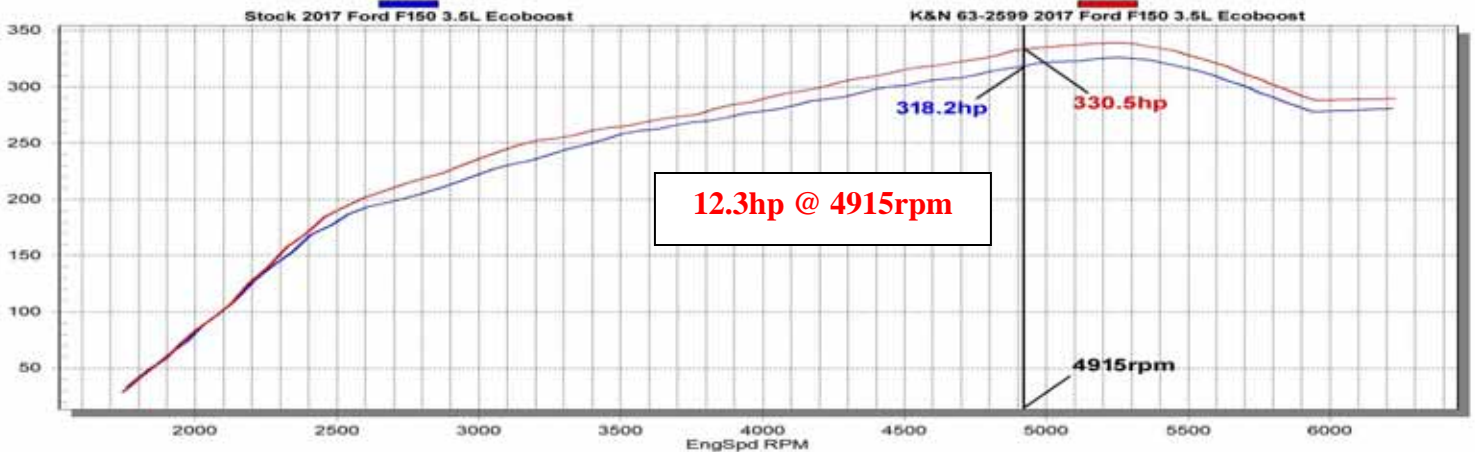
Data Group 1