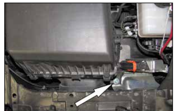
6. Remove the bolt shown that secures air filter housing to the inner fender and then lift the air filter housing up to dislodge it from the mounting grommets and remove it from the vehicle. NOTE: K&N Engineering, Inc., recommends that customers do not discard factory air intake.