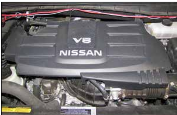
2. Lift off the decorative engine cover.

1. Turn off the ignition and disconnect the negative battery cable. NOTE: Disconnecting the negative battery cable erases pre-programmed electronic memories. Write down all memory settings before disconnecting the negative battery cable. Some radios will require an anti-theft code to be entered after the battery is reconnected. The anti-theft code is typically supplied with your owner's manual. In the event your vehicles anti-theft code cannot be recovered, contact an authorized dealership to obtain your vehicles anti-theft code.