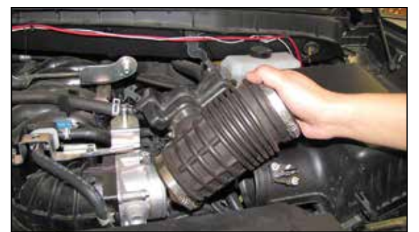
5. Loosen the two hose clamps that secure the factory intake tube and then remove the tube from the vehicle.