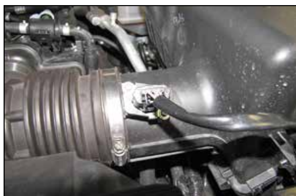
3. Disconnect the mass air sensor electrical connection and unhook the wiring harness from the air filter housing.