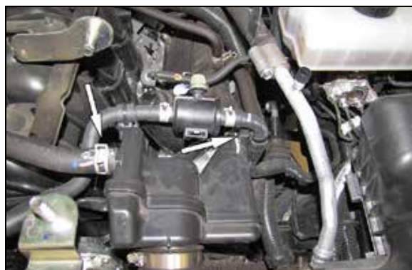
4. Release the spring clamps and then disconnect the crank case vent lines from the factory intake tube. Unhook EVAP hose retaining clips from the factory intake tube.