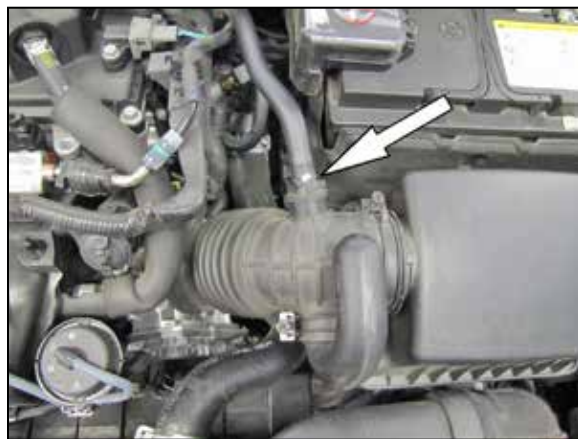
3. Release the spring clamp securing the crank case vent hose to the intake tube and then disconnect it from the intake tube.