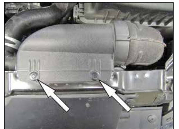
5. Release the two pins that secure the fresh air intake scoop to the core support and then remove the fresh air intake scoop from the vehicle.