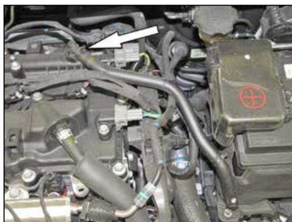
4. Release the spring clamp securing the crank case vent line to the fitting on the valve cover and then remove the hose from the engine.