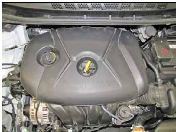
2. Lift up and remove the decorative engine cover.

1. Turn off the ignition and disconnect the negative battery cable. NOTE: Disconnecting the negative battery cable erases pre-programmed electronic memories. Write down all memory settings before disconnecting the negative battery cable. Some radios will require an anti-theft code to be entered after the battery is reconnected. The anti-theft code is typically supplied with your owner's manual. In the event your vehicles anti-theft code cannot be recovered, contact an authorized dealership to obtain your vehicles anti-theft code.