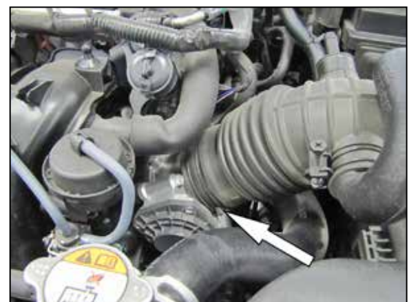
6. Loosen the hose clamp securing the intake tube to the throttle body.