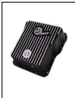
Transmission Pan Cover

P/N: 46-70012-WL (w/ Oil) 46-700012 (Blk) 46-70010 (RAW)