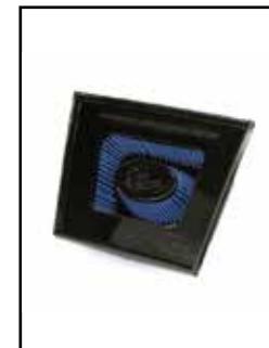
OER Air Filter

P/N: 30-80209 (P5R) 31-80209 (PDS) 73-80209 (PG7)