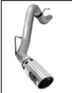
DPF-Back Exhaust System

P/N: 49-44064-B (Blk Tip) 49-44064-P (Pol Tip)