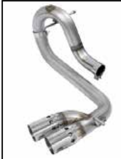
Side-Exit Exhaust System

P/N: 49-44065-B (Blk Tip) 49-44065-P (Pol Tip)