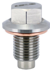
HPS Stainless Steel Magnetic Oil Drain Plug Part Number MDP-M16x150

Contact an authorized HPS Performance dealer or visit us at hpsperformance.com for more details