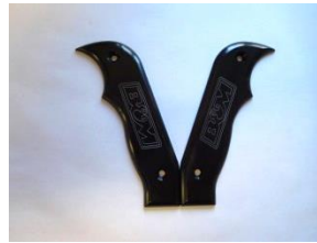
Shift Handle Grip Plates