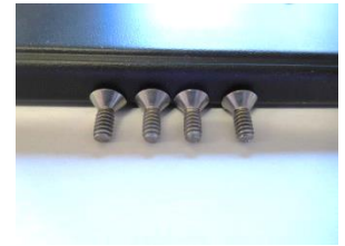
6-32 x 3/8" Flat Head Screws (4)