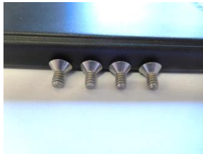
6-32 x 5/16" Flat Head Screw (4)