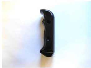
Transfer Case Handle