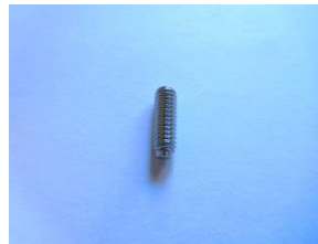
8-32 x 1/2" Set Screw