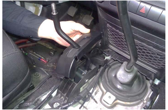
17. Slip the dust cover over the shift lever, then press it onto the shifter base. Verify the security of all 4 locking tabs. Move the shift lever to the “4 High” position.