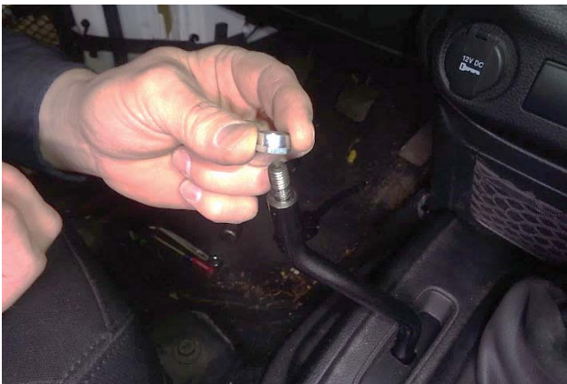
21. Install the jam nut (2) on the shift lever, with the wrench flats down. Run the nut all the way down to the shoulder.