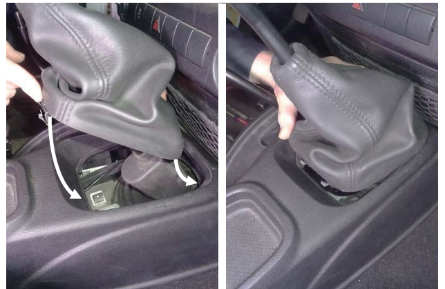
19. Slip the leather boot over the gearshift lever. Slip the 2 front hooks under the edge of the console cover, then press the 2 rear locking tabs into place.