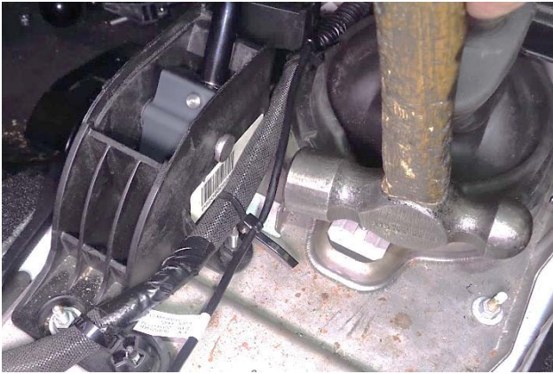
14. Seat the pivot pin by tapping gently.