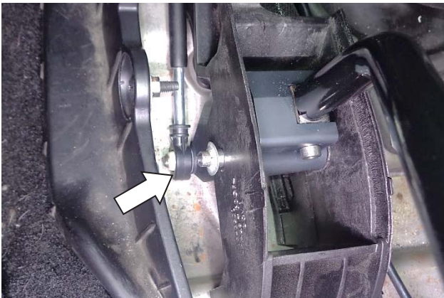
16. Push the end of the transfer case shifter cable back onto its pin until you hear or feel it “click” in place, then verify the security of the connection. Verify smooth movement of the shift lever throughout its entire range.