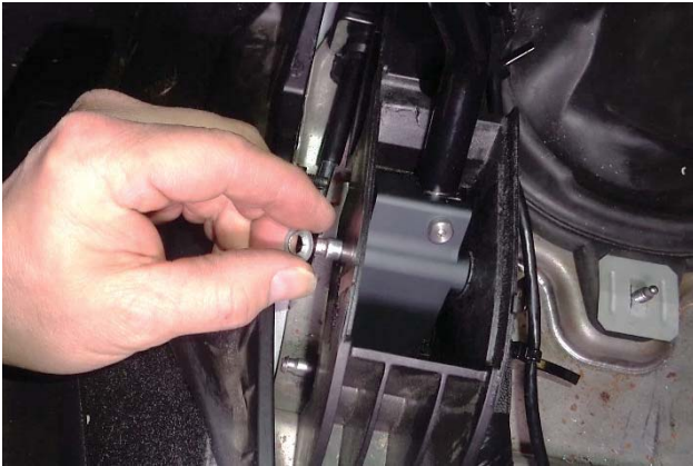
15. Push the retainer onto the tip of the pivot pin.