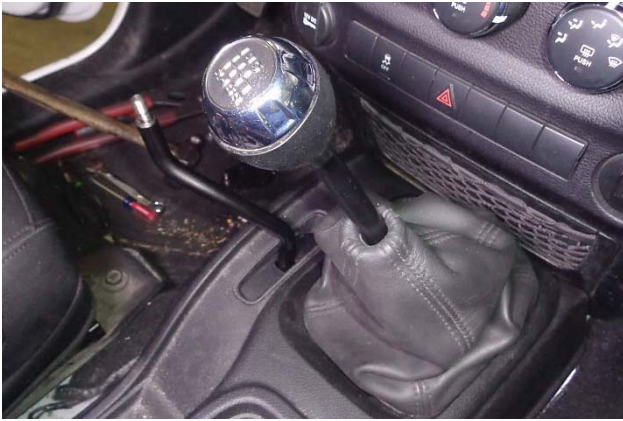
20. Press the gearshift knob onto the gearshift lever.