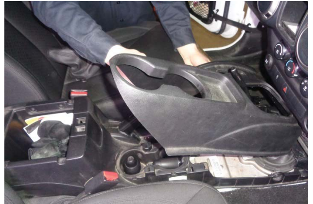
18. Open the center console storage lid, and carefully reinstall the center console cover.