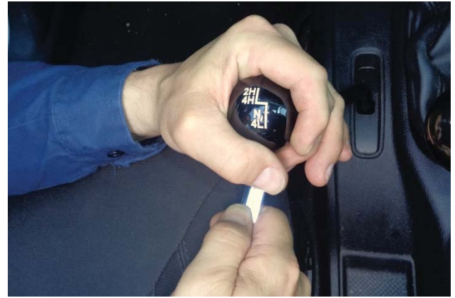
23. Tighten the jam nut against the knob.