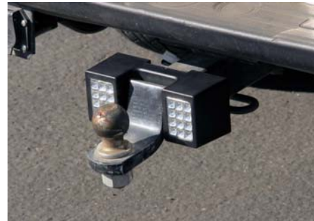
Figure 1 shows a hitch with a angled end. If this is the style hitch you have be sure to insert the longest part first or the Hitch Light will not slide onto the hitch.

Figure 2 Shows a hitch with a straight end. The Hitch Light will slide onto this no problem.