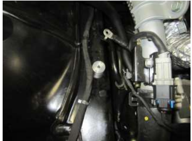
b. Install the provided spacer (06555) onto the vehicle