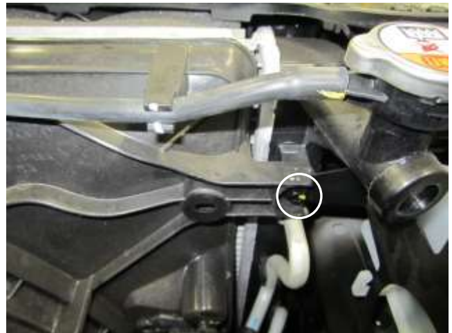
d. Align the heat shield flange with the fan shroud and install the bolt that was removed in step 2h.