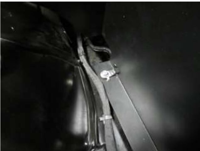
c. Install the heat shield into the vehicle on top of the spacer previously installed in step 3b. Pull the ground strap through the heat shield. Install the bolt (22224) through the two washers (1-3025 & 08275), the heat shield, and the spacer and tighten to the vehicle.