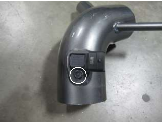
a. Install the temperature sensor into the AEM intake tube and secure with the bolt removed in step 2j.

When installing the intake system, do not completely tighten the hose clamps or mounting hardware until instructed to do so.