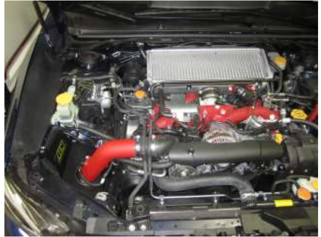
AEM Intake Installed.