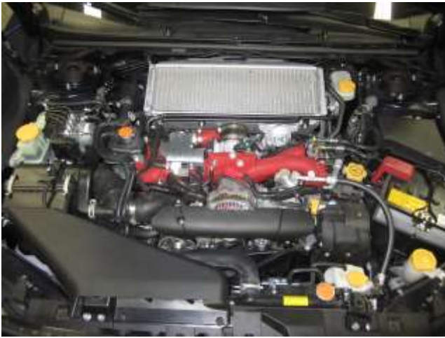
Stock Intake Installed.