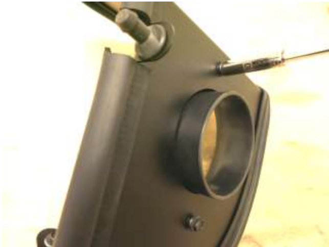
d. Orient and fasten the air horn(21512-1) to the heat shield as shown with the split washers(1-3025) and bolts (1-2110) included in the kit.