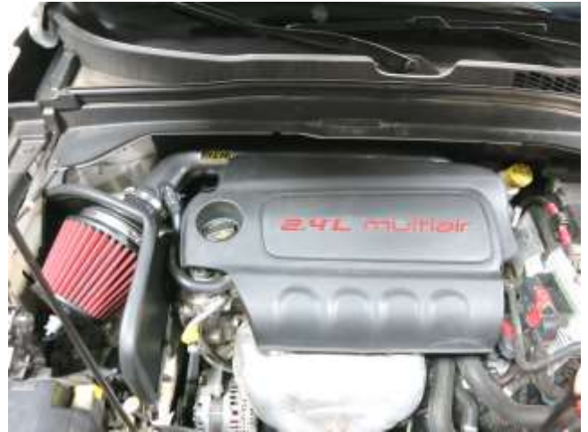
p. Finished installation of AEM Intake System.