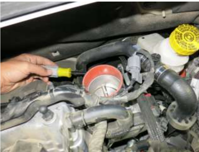
g. Install the supplied coupler(5-272) and fasten using the hose clamp(9444) as shown. Loosely slide the other hose(9444) clamp over the other end of the coupler.