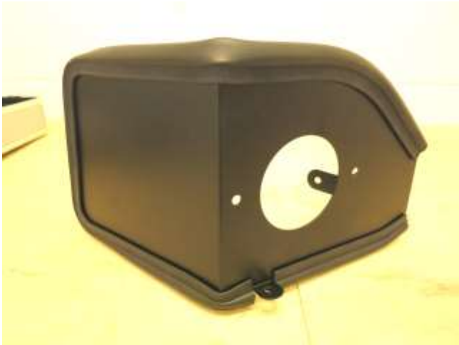
b. Install the supplied edge trim(102496, 8-4008) as shown and trim accordingly if needed with side cutters.