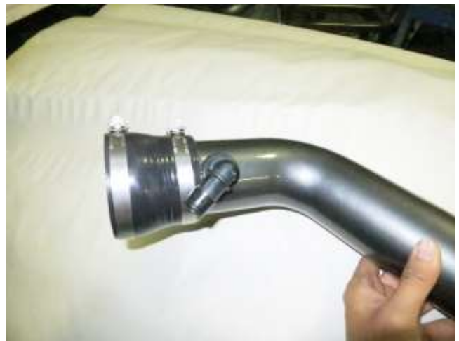
h. Pre-assemble the AEM tube as shown, installing the provided coupler(5-353), hose clamps(9448, 9456), rubber grommet(784645) and plastic elbow(8-139).