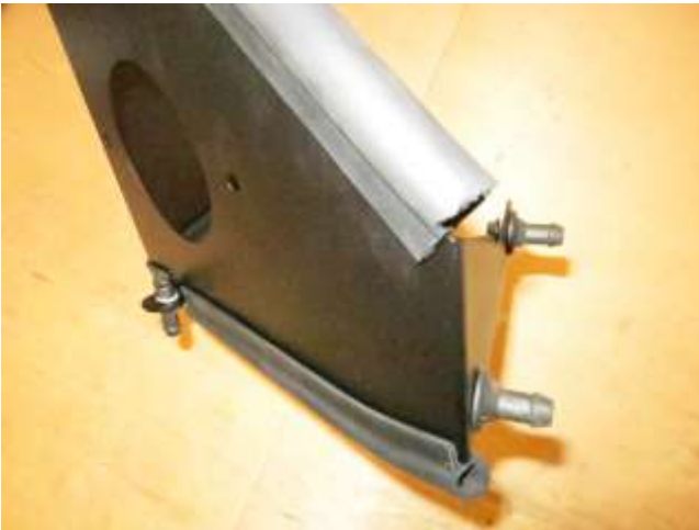
c. Fasten the supplied plastic mounts(8-186-1) to the heat shield as shown using the supplied split washers(1-3036) and M6 bolts(1-2110).