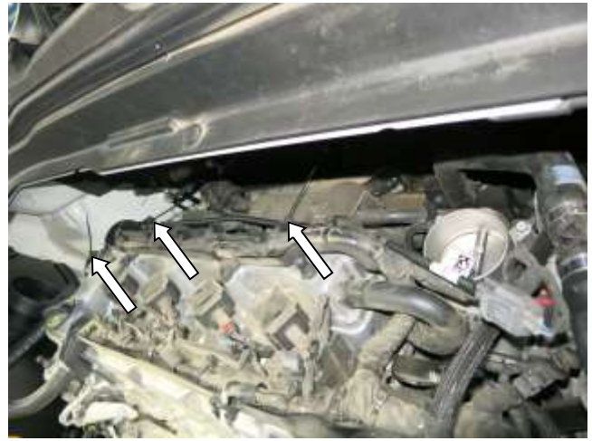
f. Extend the stock IAT wire harness by installing the extension(21781) provided and fasten as indicated using the provided zip ties(1-113).