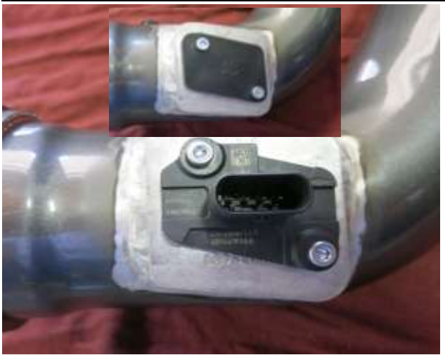
i. If equipped with humidity sensor, install the sensor into the sensor pad as shown with supplied hardware otherwise install block-off plate with supplied gasket and hardware as shown.