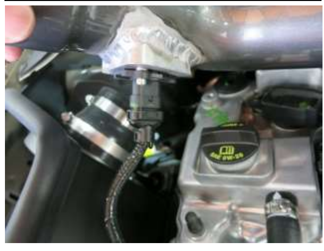
i. If equipped with humidity sensor, attach the electrical connector at this time otherwise proceed to next installation step.