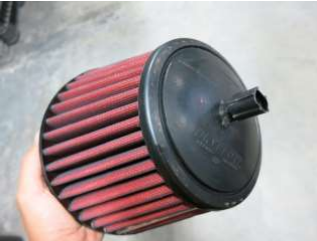
a. Carefully install the IAT sensor into the endcap of the AEM filter. Note: Soapy water will help with installation.

a. When installing the intake system, do not completely tighten the hose clamps or mounting hardware until instructed to do so.