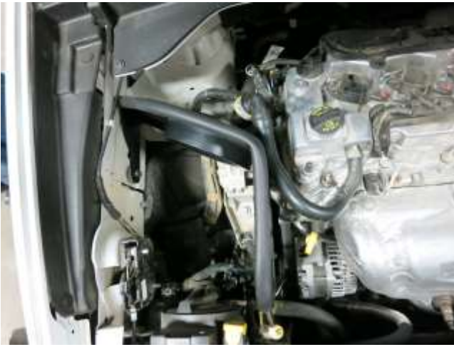
e. Install the heat shield as shown into the original air box mounting grommet locations.