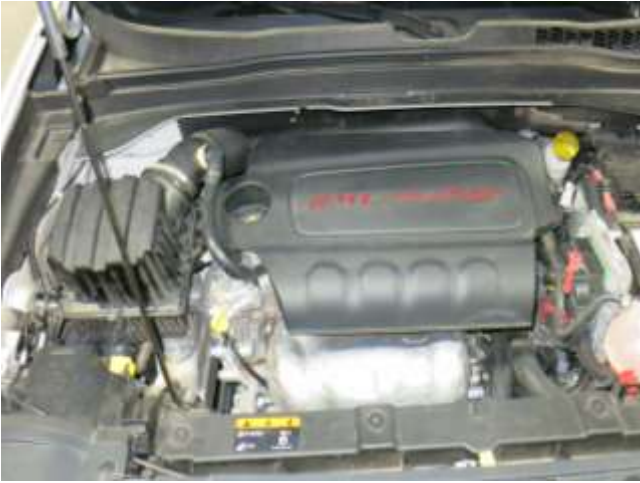
o. Factory air induction system.