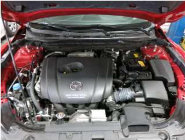
o. Factory air induction system.