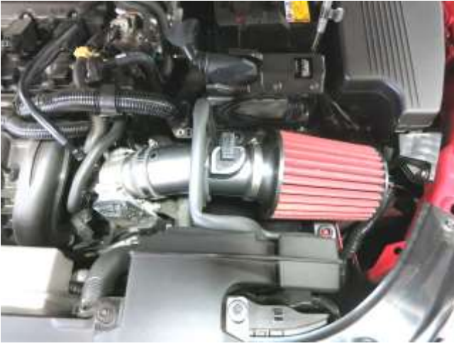
k. Install the AEM filter onto the intake tube.