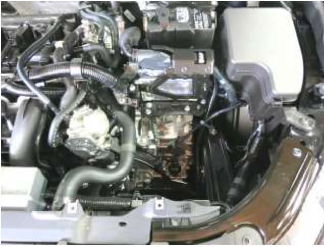
i. Gently remove factory lower air box and factory cold air inlet scoop.