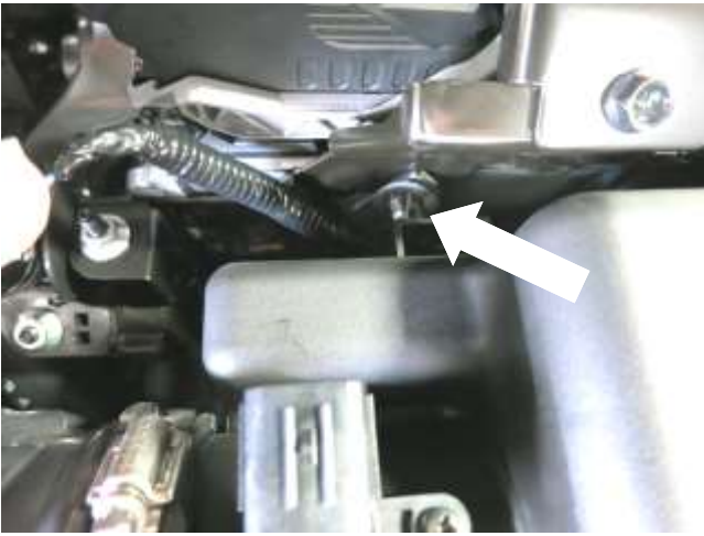
e. Use needle nose pliers to unclip wire harness from air box.