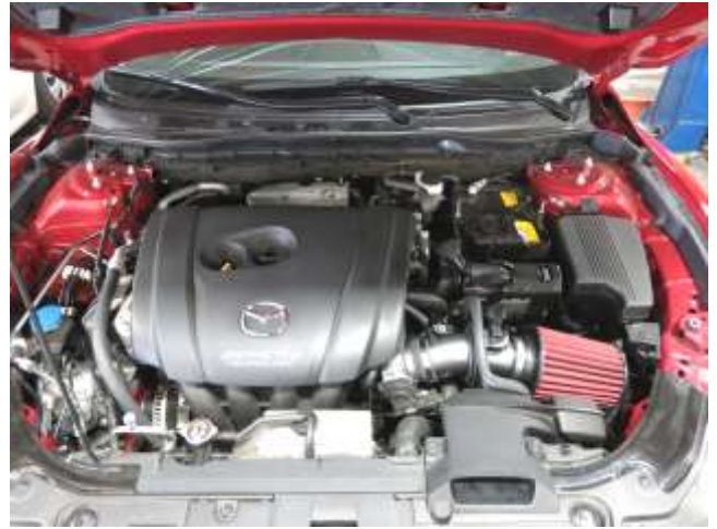
p. Finished installation of AEM Intake System.