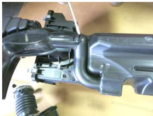
b. Unclip the resonator chamber from the cold air scoop while rotating the cold air scoop gently.