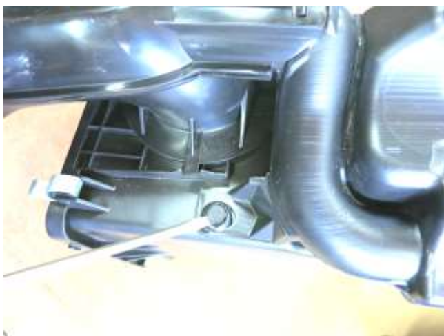
a. Unclip the two plastic retainers securing the cold air inlet scoop to the factory air box.

a. When installing the intake system, do not completely tighten the hose clamps or mounting hardware until instructed to do so.