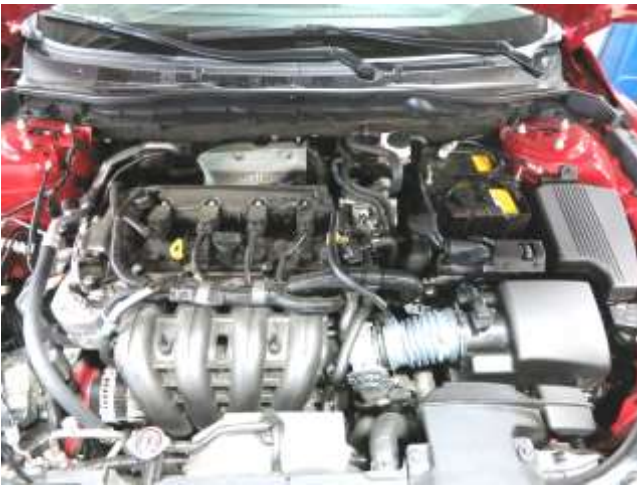
a. Remove engine cover by gently pulling it up and away from the top of the engine.