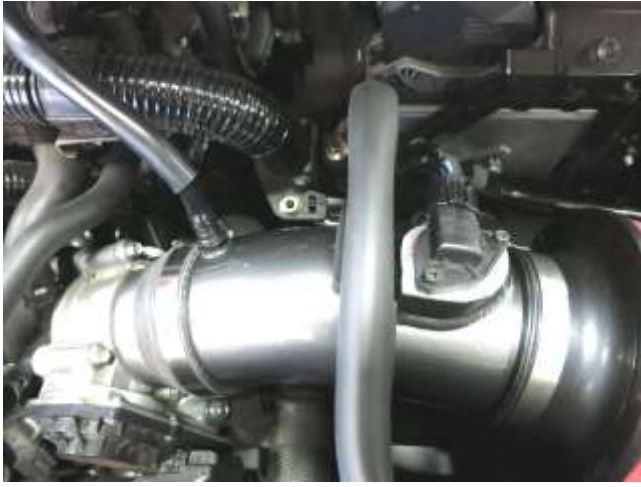
l. Install the breather hose into the coupler and reconnect the MAF sensor wiring.