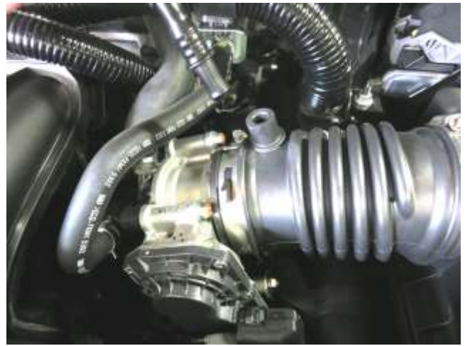
b. Remove breather hose from factory coupler.