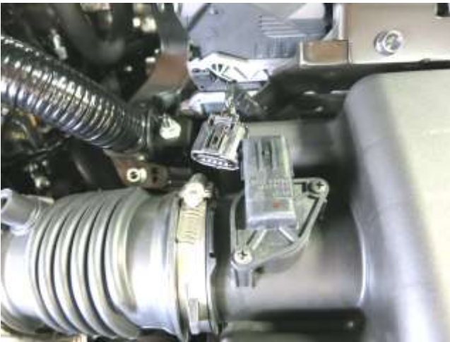
c. Unplug MAF sensor harness.