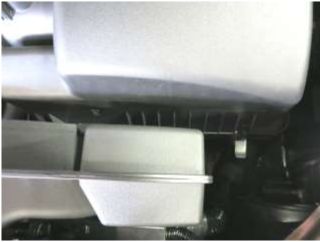
f. Unclip air box lid from lower air box.