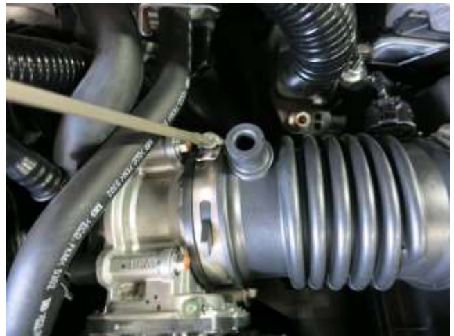
d. Loosen hose clamp securing coupler to throttle body.