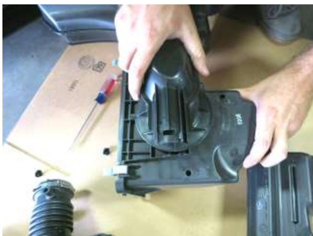
c. Separate the cold air scoop from the lower air box.