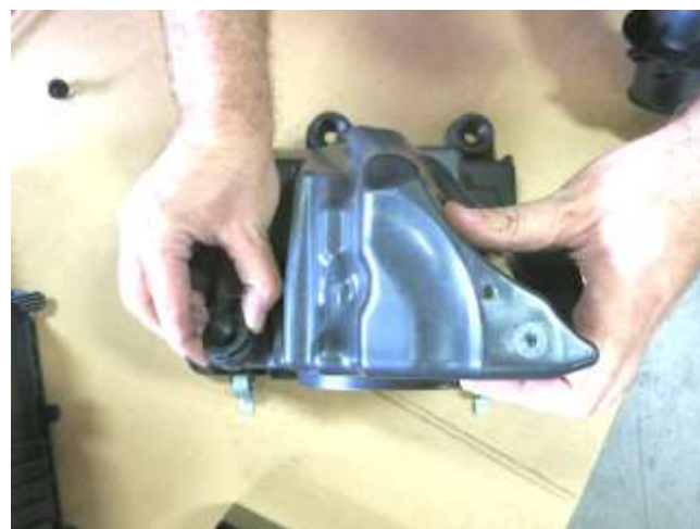
d. Remove the three rubber grommets from the factory air box and insert them into the AEM heat shield.