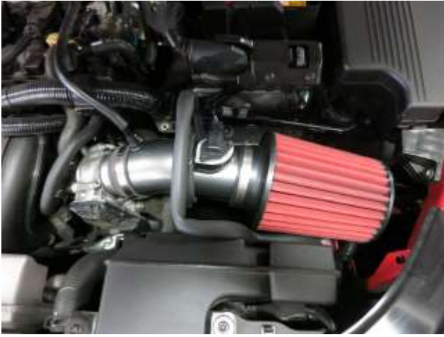
m. Check for clearance around the filter, heat shield and intake tube then tighten all hose clamps. Reinstall the engine cover.