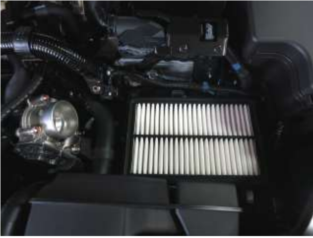
g. Remove the air box lid along with the air inlet hose.