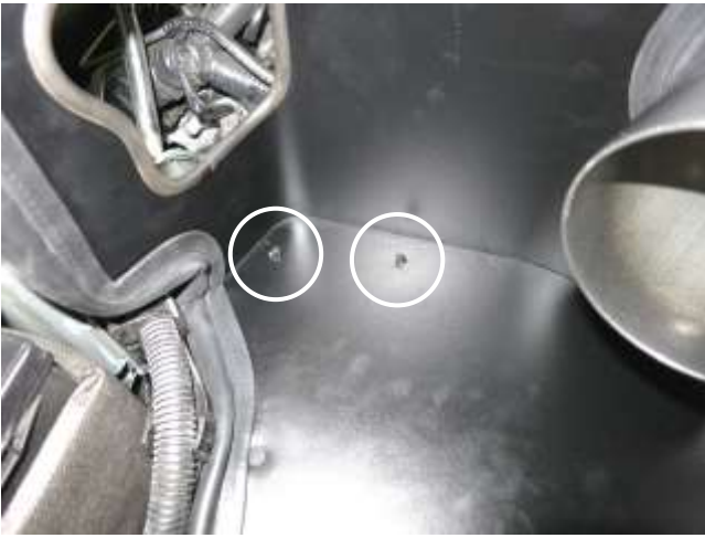
i. Install the transmission vent line clips to the heat shield from the bottom.