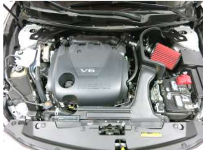
AEM INTAKE INSTALLED