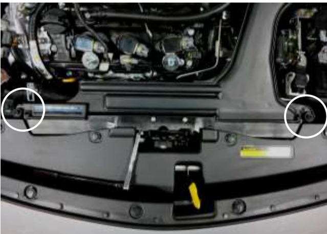
m. Install the stock air scoop into the AEM heat shield and then secure to the vehicle with the hardware that was removed in step 2a.