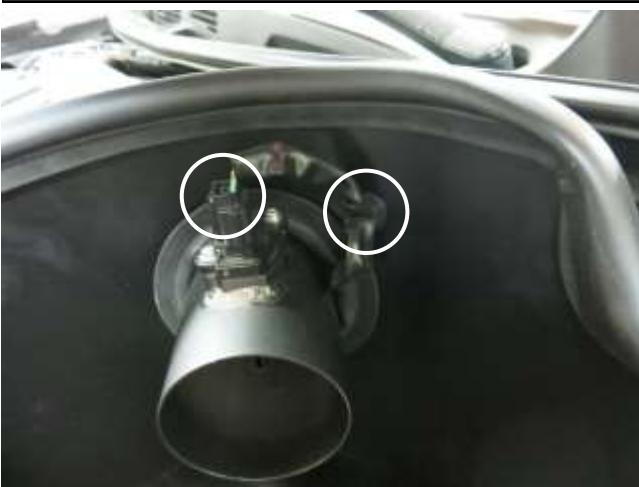
g. Route the MAS harness through the hole via the opening in the bottom portion of the hole, then clip it onto the heat shield and reconnect it back onto the MAS.