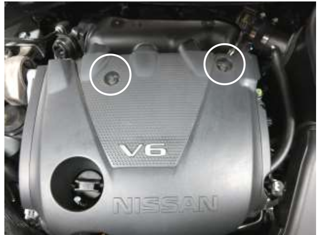
n. Install the engine cover with the hardware that was removed in step 2b.