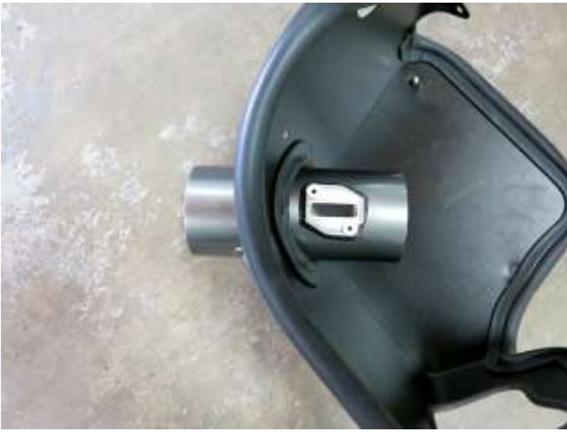
c. Install the AEM intake tube into the hole in the heat shield.