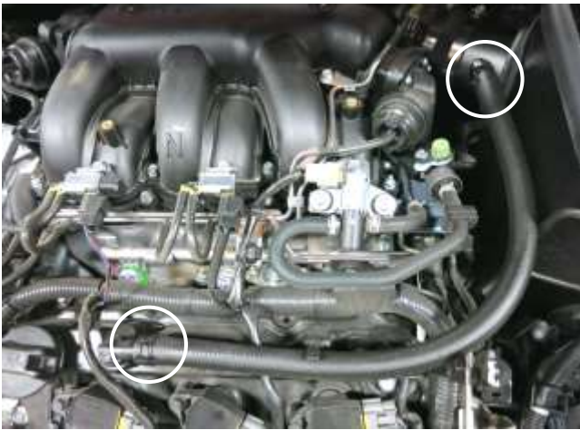
k. Install the completed vent line onto the AEM intake tube and the 90° fitting. Then, secure with the spring clamps.