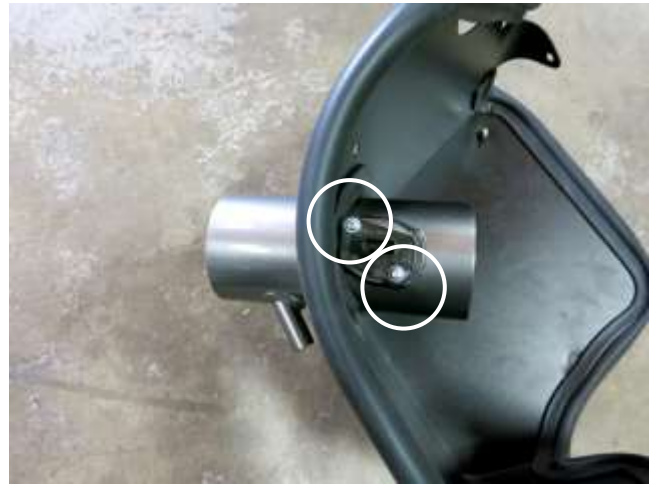
d. Install the MAS and screws that were removed in step 21.