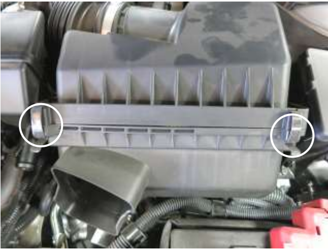
g. Un-latch the two clips that secure the upper to lower air box.