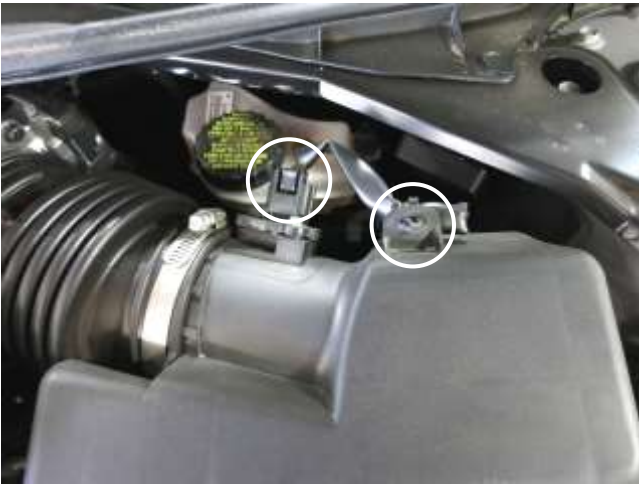
e. Remove the MAS (Mass Airflow Sensor) connector from the MAS. Then, squeeze and remove the two wiring harness clips secured to the upper air box. Reference picture 2d. to locate the rear clip.