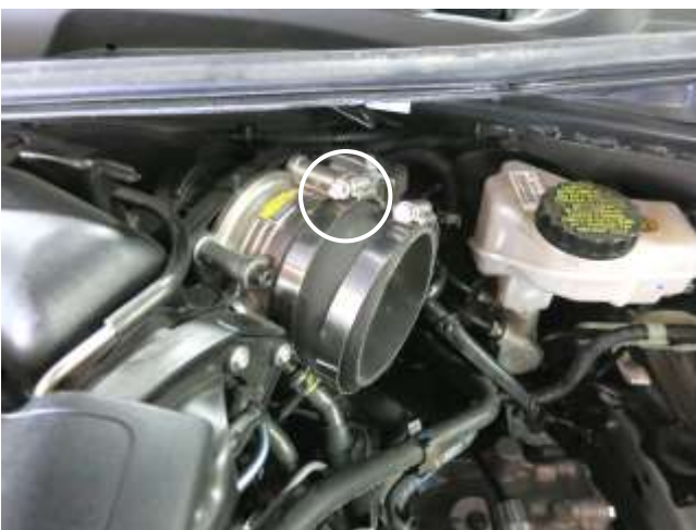
e. Install the provided coupler and hose clamps onto the throttle body. Tighten the hose clamp closest to the throttle body at this time to 30 in. lbs.