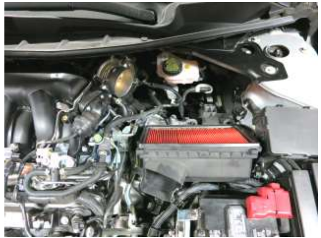
h. Remove the upper intake assembly from the vehicle. Reference picture 2d. to locate the push in fitting under the intake manifold.