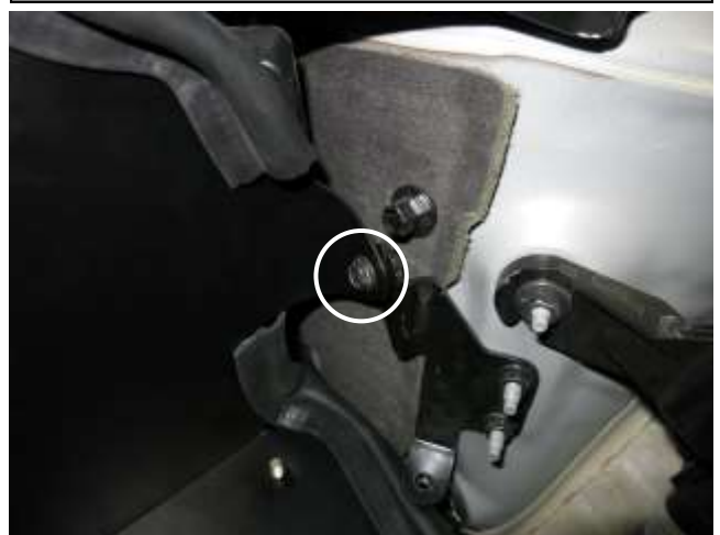
h. Install and tighten the provided bolt from the heat shield to the bracket on the inner fender.