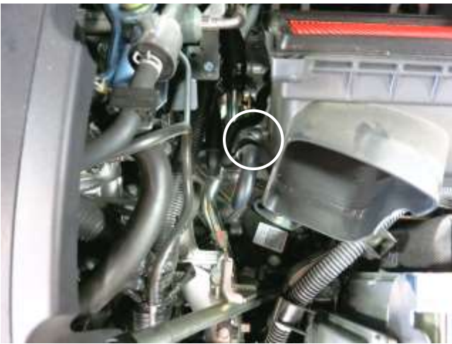
i. Remove the vent line clip on the side of the lower air box.