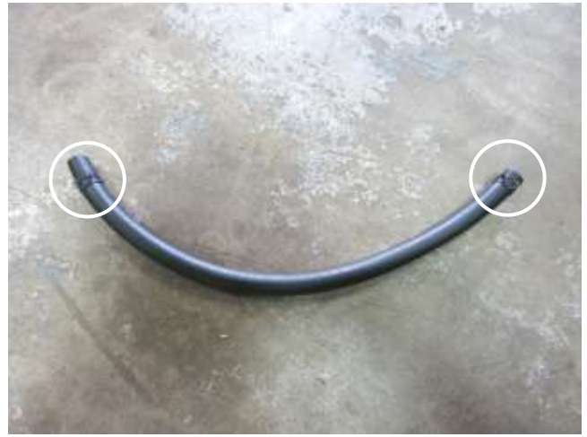
j. Install the spring clamps that were removed in step 2c. onto the provided vent line as shown.