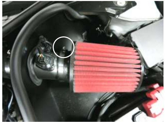
l. Install the AEM filter onto the AEM intake tube and tighten the hose clamp to 30 in. lbs.