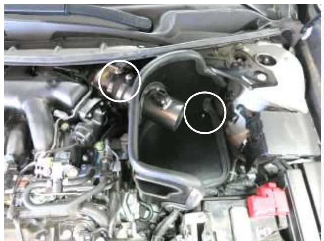
f. Install the heat shield into the vehicle aligning the push in mounts with the vehicles rubber grommets. Then align the AEM intake tube with the coupler.