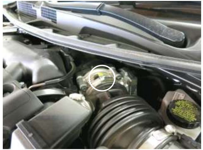
f. Loosen the hose clamp at the throttle body.