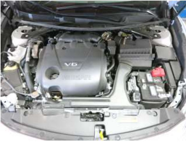
STOCK INTAKE INSTALLED