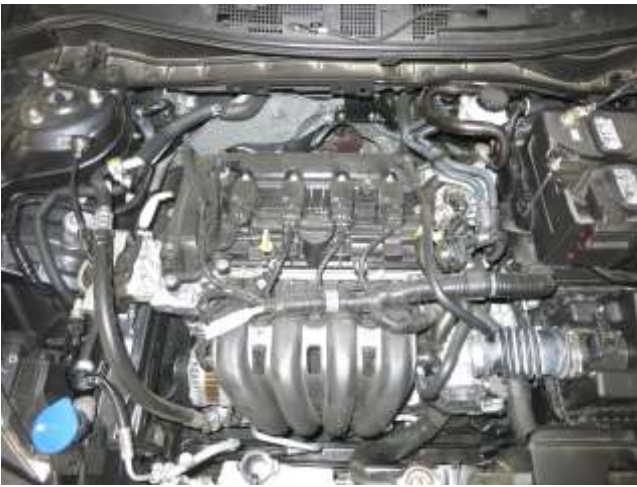
a. Carefully pull up on the engine cover and remove it.