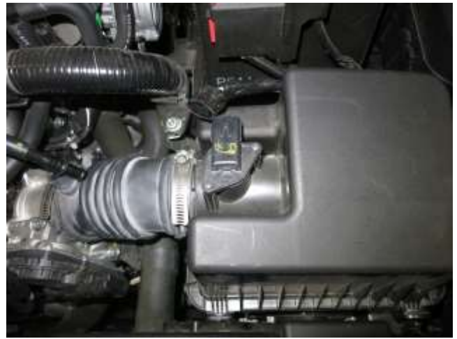
b. Unplug harness from MAF (Mass Air Flow) sensor.