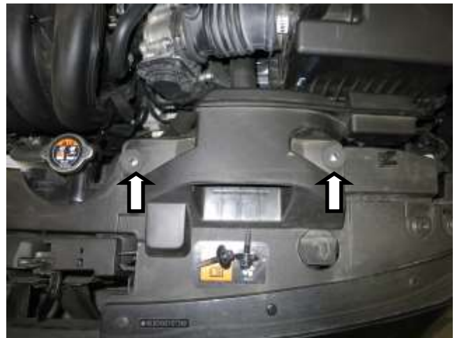
d. Use a 10mm socket and ratchet to remove the (2) M6 bolts holding the intake snorkel to the radiator shroud. These bolts will be reused in step 3f.