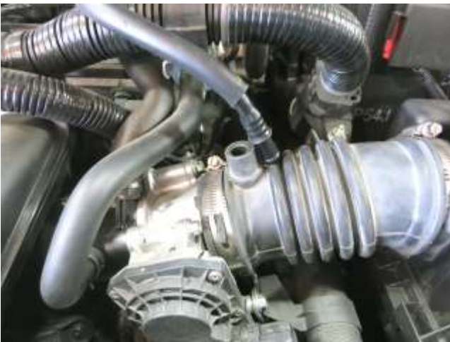
c. Use a 7mm socket and ratchet to loosen the throttle body hose clamp. Then, pull the PCV line out from the nipple on the intake hose.