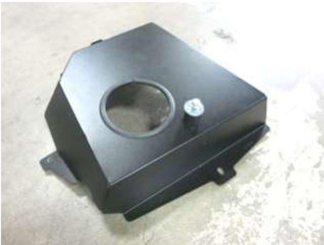
c. Install the edge trim and rubber mount to the heat shield as shown.