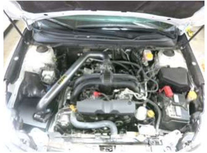
AEM INTAKE INSTALLED