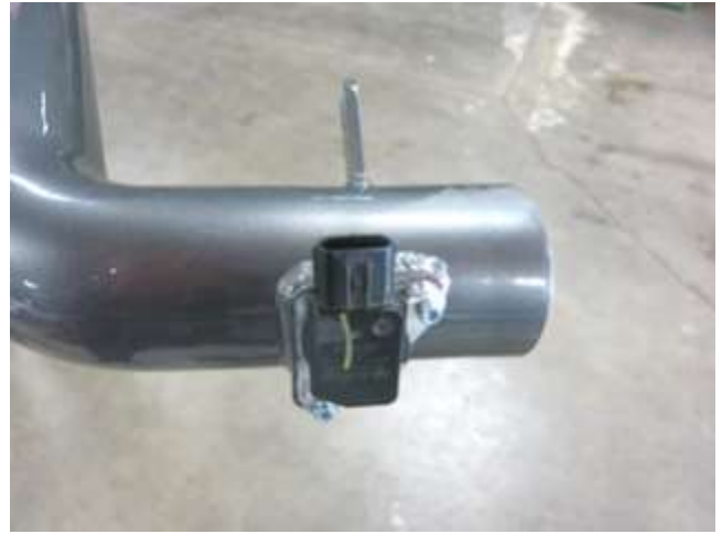
b. Install the MAF sensor to the intake tube with the 2 supplied socket head bolts.