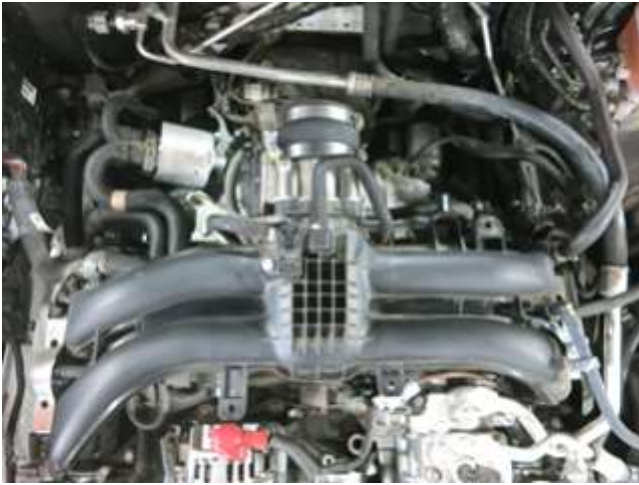
a. Install the hose coupler and 2 hose clamps onto the throttle body. Tighten clamp on the throttle body.

a. When installing the intake system, do not completely tighten the hose clamps or mounting hardware until instructed to do so.