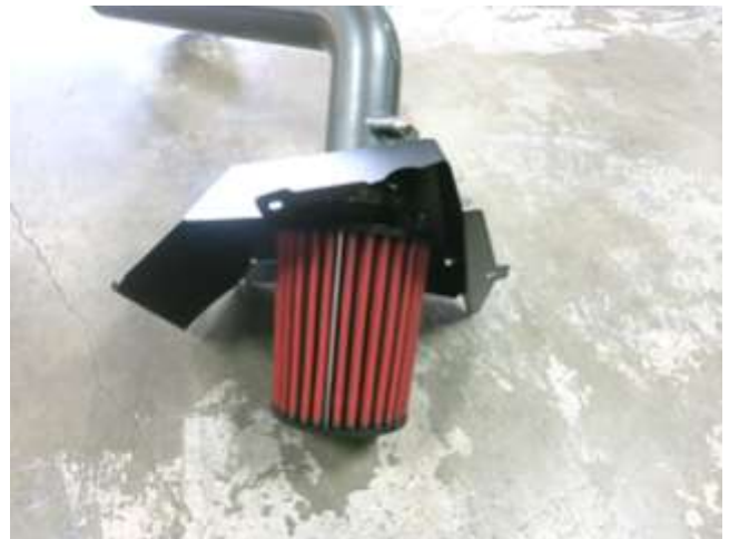
d. Route the intake tube through the cut out on the heat shield and install the air filter.