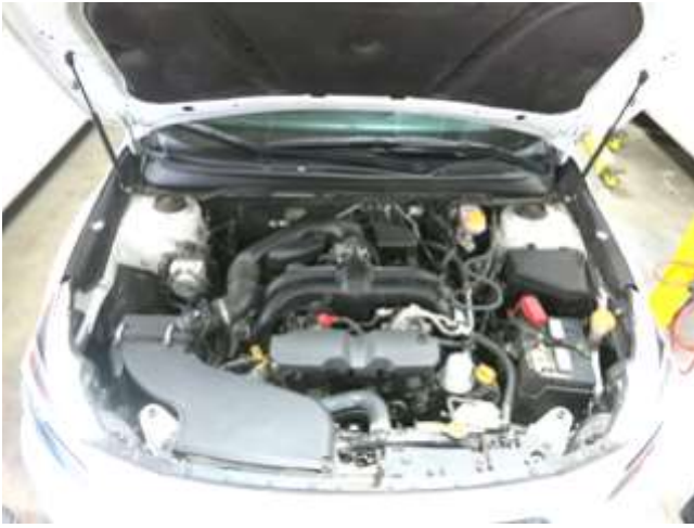
STOCK INTAKE INSTALLED