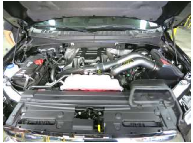
AEM INTAKE INSTALLED