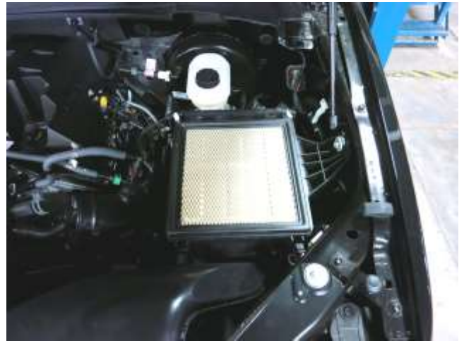
f. Remove your stock air filter from the lower air box.