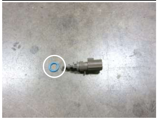
h. Remove the O-ring from air temperature sensor. Note: The O-ring will not be reused.