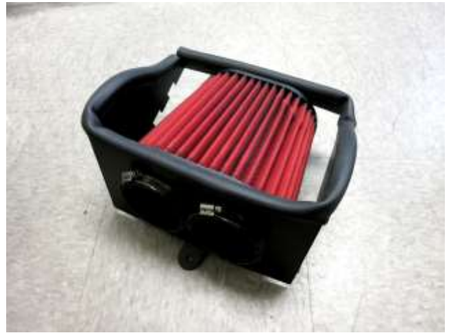
d. Install the AEM filter into the heat shield with the provided hose clamps.