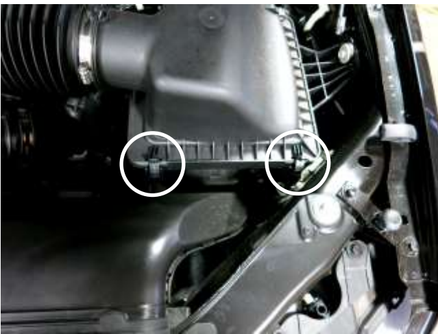
a. Detach the two latches securing the upper air box lid to the lower air box lid.