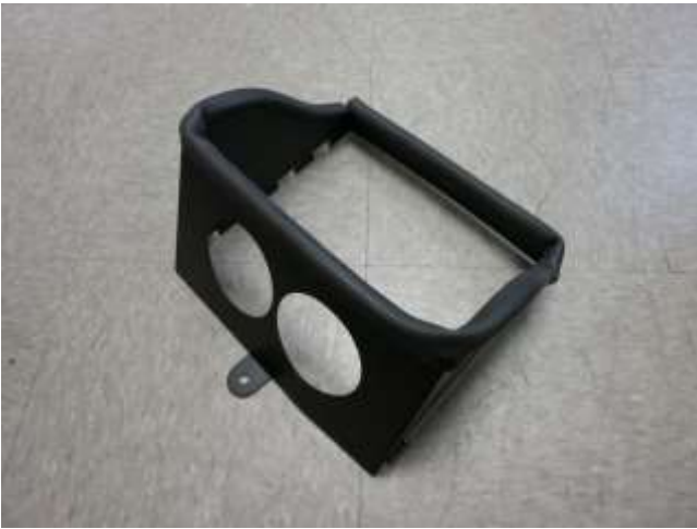
c. Install the provided edge trim onto the heat shield as shown. Note: Trimming the edge trim maybe necessary.