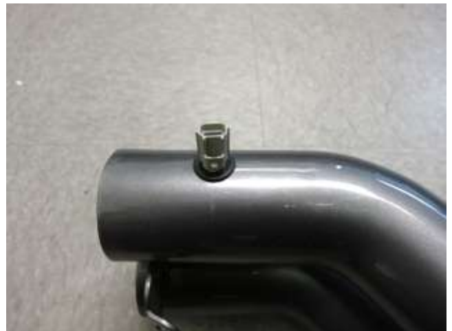
j. Install the air temperature sensor that was removed in step 2g into the AEM intake tube.