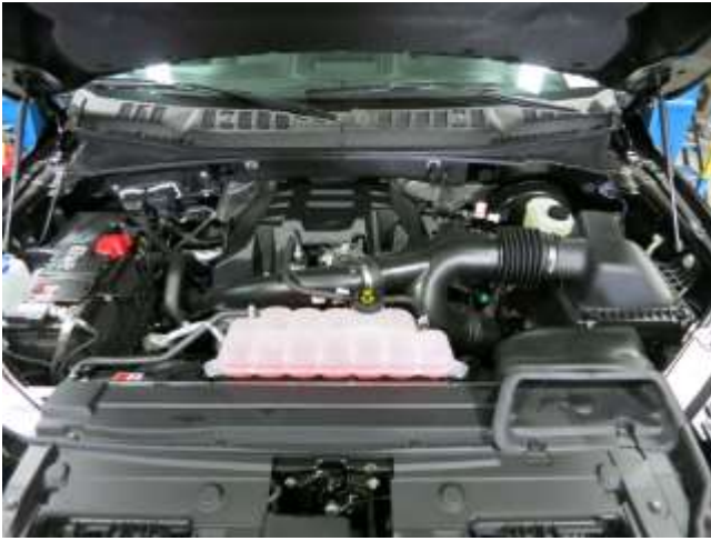
STOCK INTAKE INSTALLED