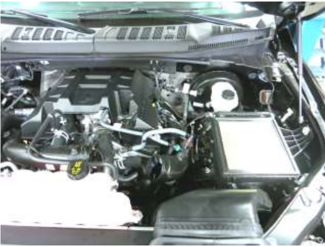
e. Remove the stock air intake system from the vehicle. Note: Do not discard any of your stock equipment.