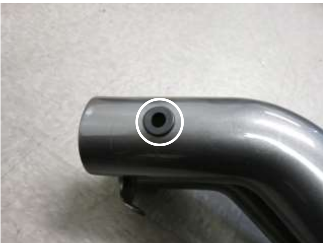
i. Install the provided grommet into the AEM intake tube.