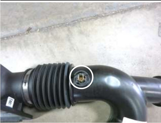
g. Remove the air intake temperature sensor from the stock intake tube. Note: This will be reused in step 3b.