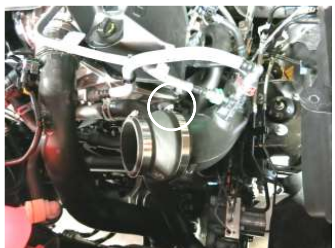
h. Install the step coupler with the provided hose clamps onto the lower intake tube as shown. Tighten hose clamp circled.