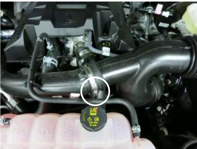
c. Loosen the hose clamp at the upper air intake tube.