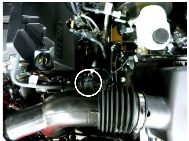
b. Disconnect the intake air temperature sensor connector.