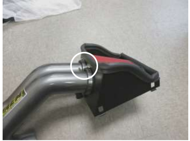
f. Install the AEM intake tube into the AEM air filter while aligning the rubber mount with the bracket on the intake tube. Tighten the hose clamps on the filter.