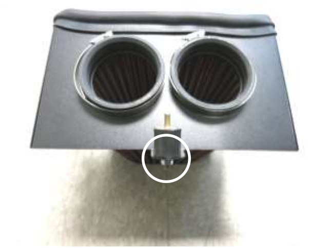
e. With the provided hardware, install the rubber mount/washer/nut onto the heat shield tab.