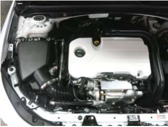
STOCK INTAKE INSTALLED