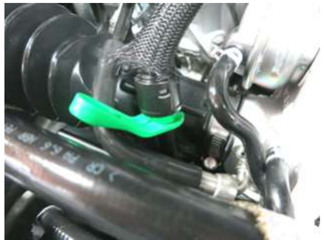
b. Use a 5/8" AC/fuel line disconnect tool to release the PCV connection. Pull the PCV line free and away from the fitting.