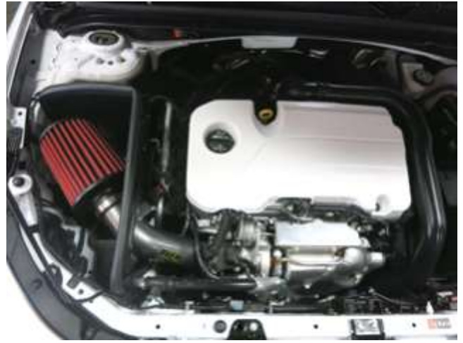
AEM INTAKE INSTALLED