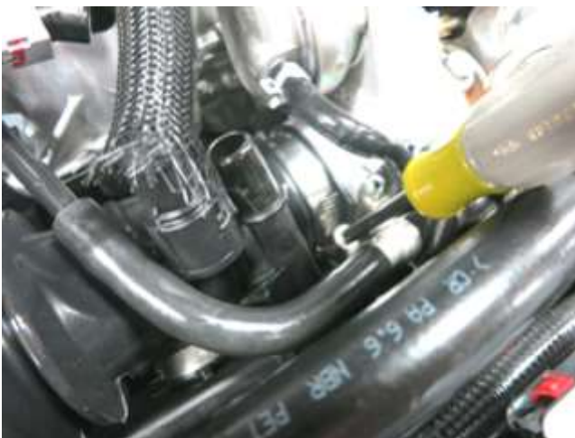
c. Loosen the hose clamp at the turbo side of the factory air hose.