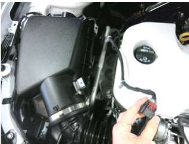
a. Disconnect the Mass Air Flow (MAF) sensor connector and harness ties from the sensor and air box.