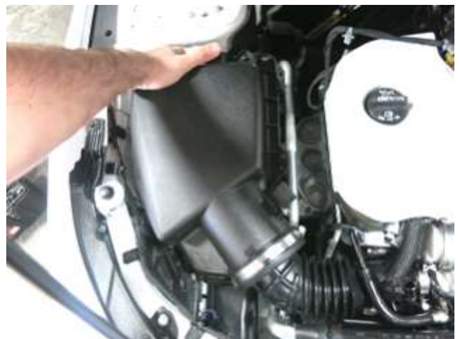
d. Release the air box from its rubber grommets by pulling up gently on the air box as shown.