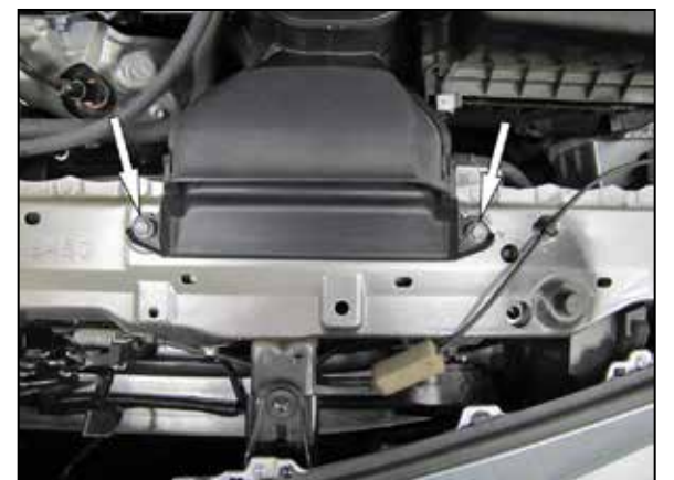
3. Remove the two bolts that secure the fresh air intake duct and then remove the duct from the vehicle.