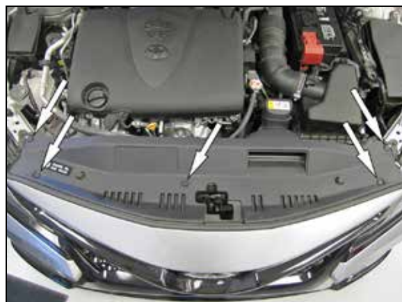
2. Remove the five push pins that secure the radiator cover and then remove the radiator cover.

1. Turn off the ignition and disconnect the negative battery cable. NOTE: Disconnecting the negative battery cable erases pre-programmed electronic memories. Write down all memory settings before disconnecting the negative battery cable. Some radios will require an anti-theft code to be entered after the battery is reconnected. The anti-theft code is typically supplied with your owner's manual. In the event your vehicles anti-theft code cannot be recovered, contact an authorized dealership to obtain your vehicles anti-theft code.