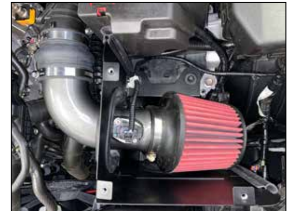
14. Install the air filter onto the intake tube and secure with the provided hose clamp.