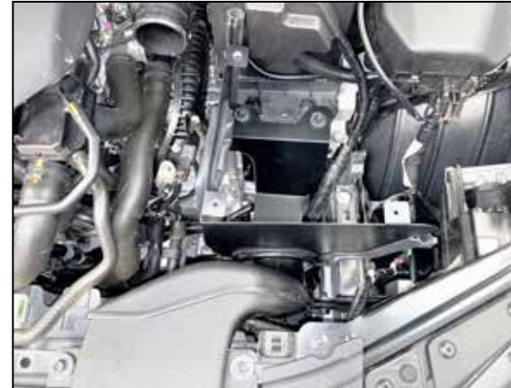
10. Install the heat shield assembly onto the mounting posts and secure the fresh air intake duct with the factory hardware.