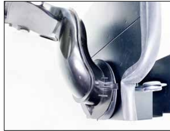
9. Install the fresh air duct into the AEM heat shield.