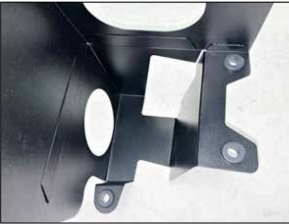
5. Install the provided grommets into the heat shield as shown.