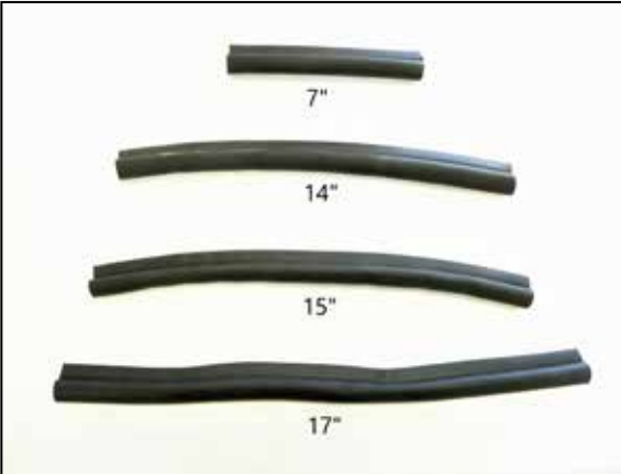
6. Cut the edge trim into sections as shown.