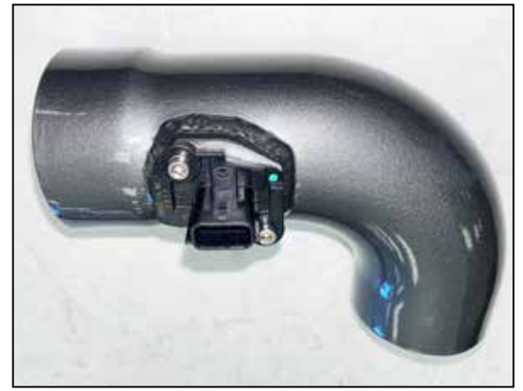
12. Remove the mass air sensor from the factory air filter housing and install it into the AEM intake tube and secure with the provided hardware.