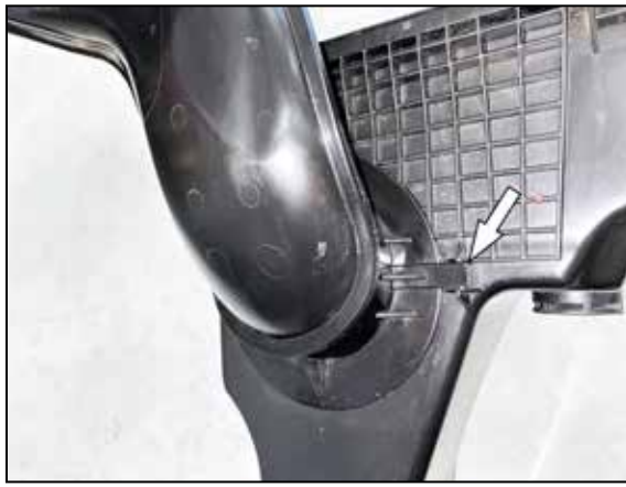
8. Release the tab that locks the fresh air duct to the lower air filter housing then rotate the fresh air duct counterclockwise and remove it from the housing.