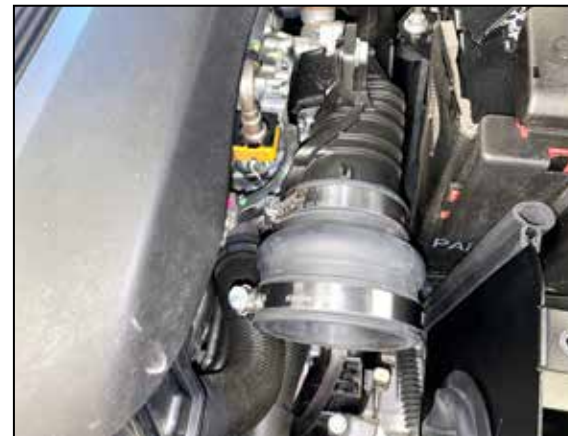
11. Install the provided hump coupler and secure with the provided hose clamp.