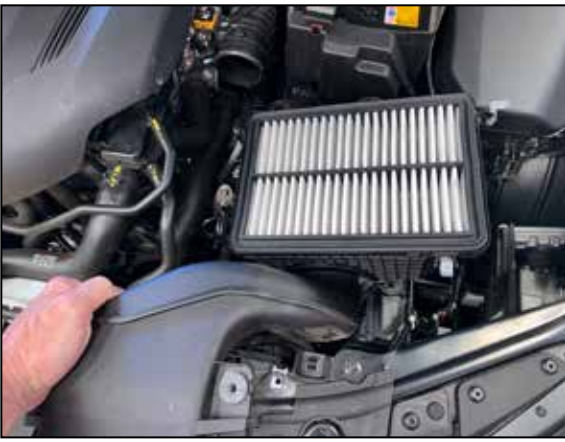
4. Pull up the lower air filter housing to dislodge it from the mounting grommets and remove it from the vehicle.