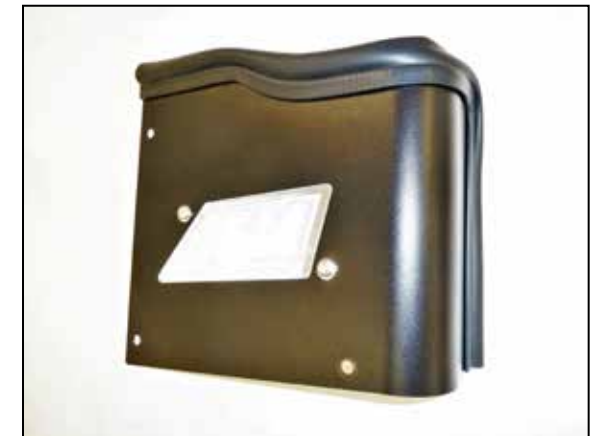
15. Install the 17" edge trim onto the heat shield lid as shown. Install the AEM window into the heat shield lid using the provided hardware.