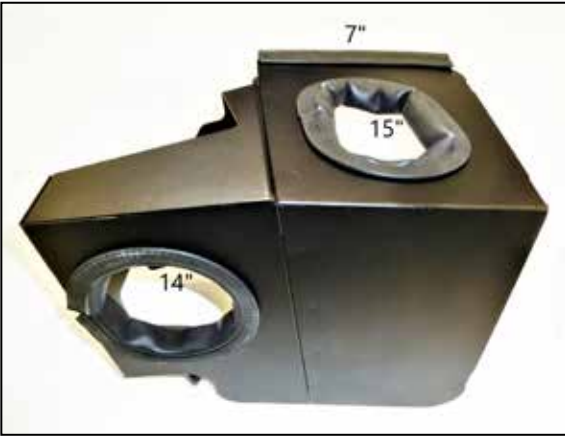
7. Install the edge trim onto the heat shield as shown.