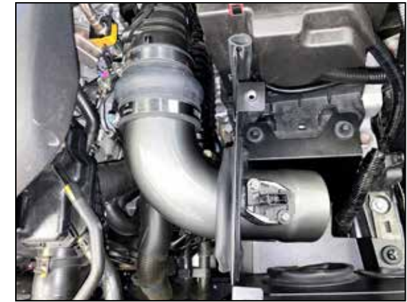
13. Install the AEM intake tube through the heat shield and into the coupler. Secure the coupler with the provided hose clamp.