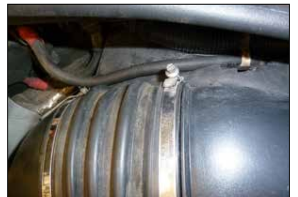
3. Loosen the hose clamp that secures the intake hose to the air filter housing.