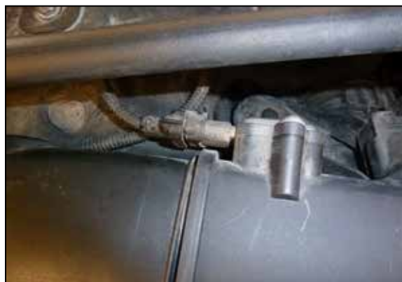
2. Disconnect the maf sensor electrical connection.

NOTE: Disconnecting the negative battery cable erases pre-programmed electronic memories. Write down all memory settings before disconnecting the negative battery cable. Some radios will require an anti-theft code to be entered after the battery is reconnected. The anti-theft code is typically supplied with your owner's manual. In the event your vehicles anti-theft code cannot be recovered, contact an authorized dealership to obtain your vehicles anti-theft code.