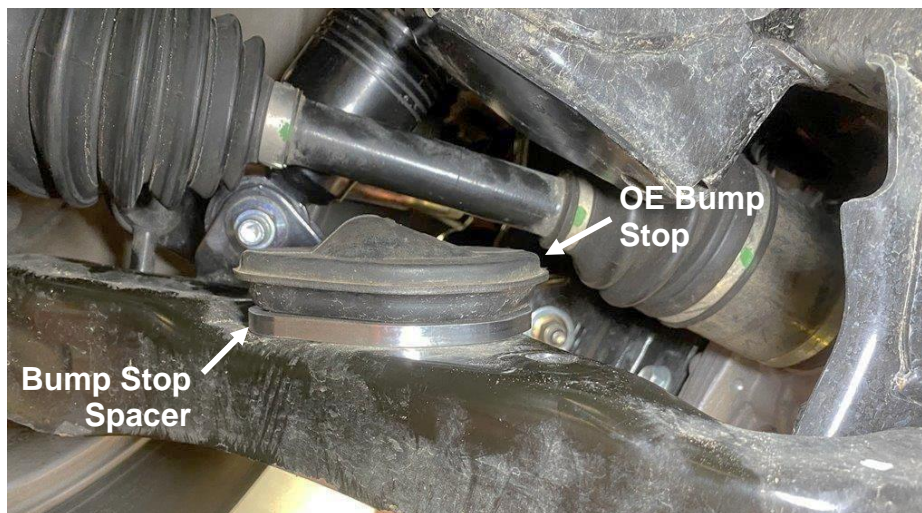
Figure 2: Bump Stop with Installed Spacer