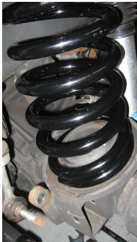
Figure 7. Driver side (pictured with 5112 kit)