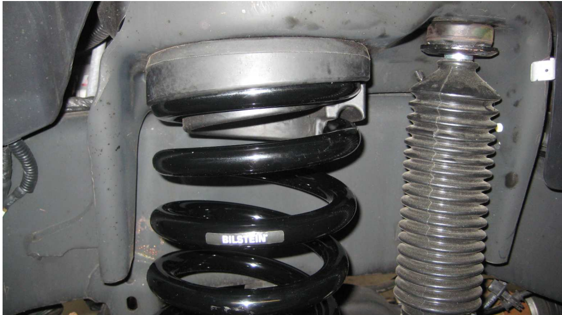
Figure 6. Driver side (pictured with 5112 kit)