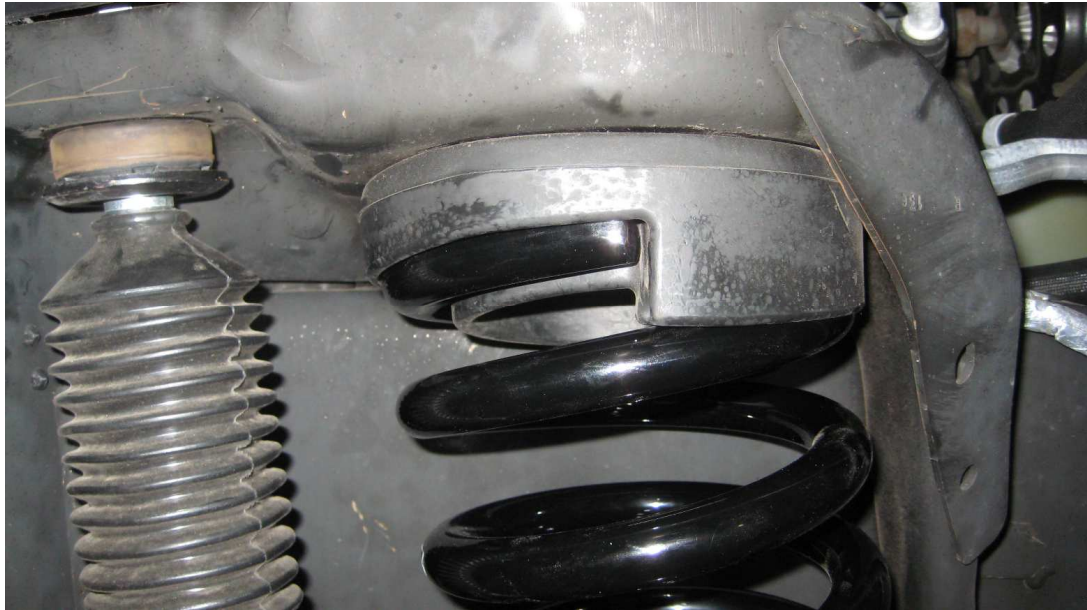
Figure 4. Passenger side (pictured with 5112 kit)