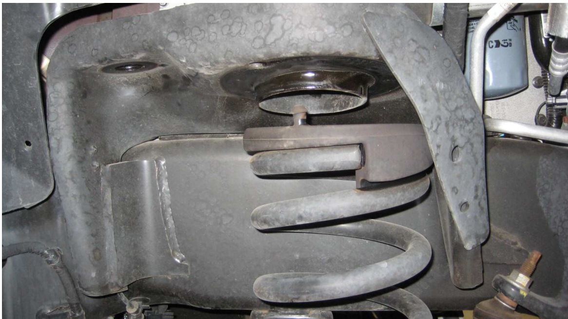
Figure 3. Passenger side