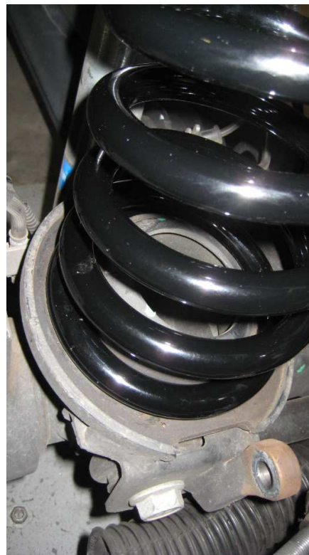
Figure 5. Passenger side (pictured with 5112 kit)