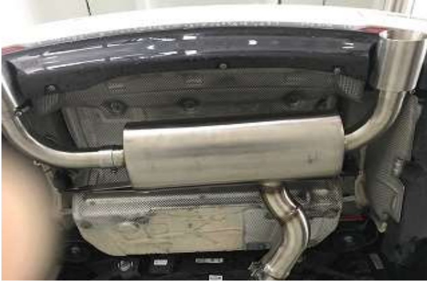
Under carriage view of exhaust installed.