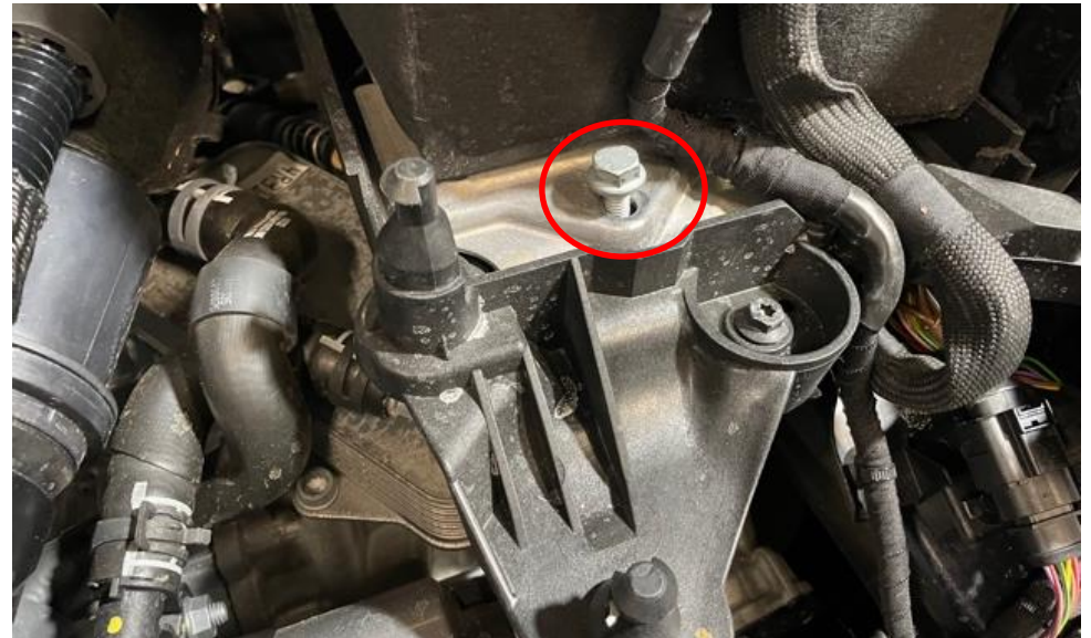
8. Remove the bolt holding the battery clamp down.