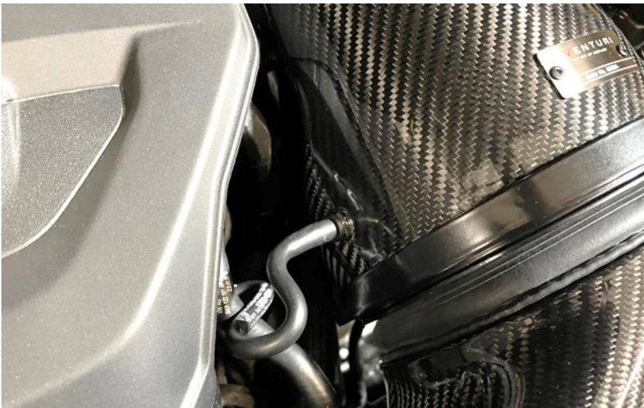
23. Push the vacuum hose onto the filter housing fitment.