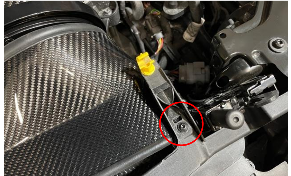
22. Secure the duct with the 2 x M5 screws provided. 1 Screw each side.