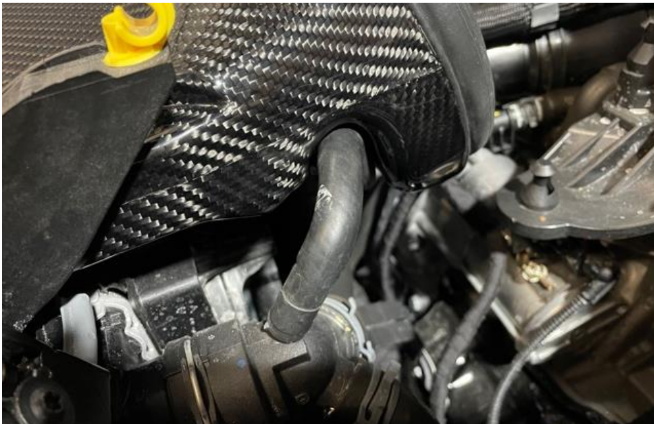
19. The coolant hose will sit inside the recess in the duct. Pull the hose away from the duct to avoid kinks and to give it more slack.