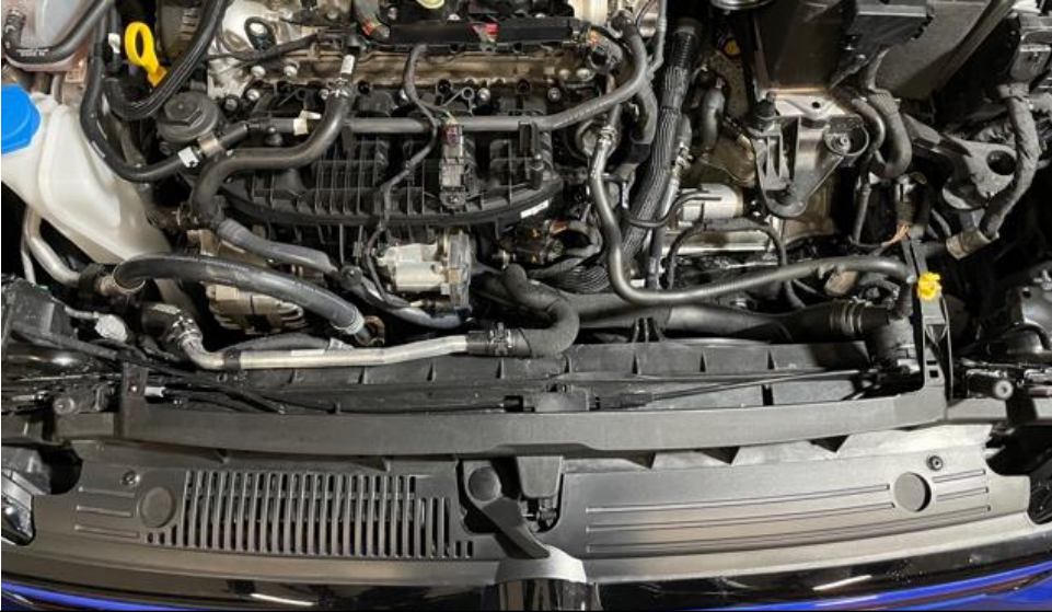
5. Remove the duct from the engine bay. Push it down to release the clips on each side. Also remove the engine cover.