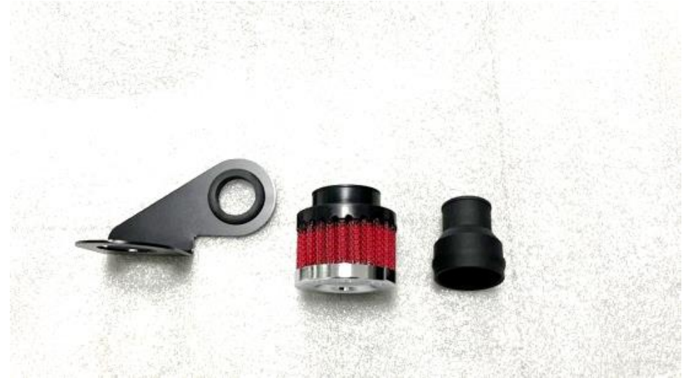
14. USA Golf Gti Only : Take the secondary breather filter, bracket and adapter.