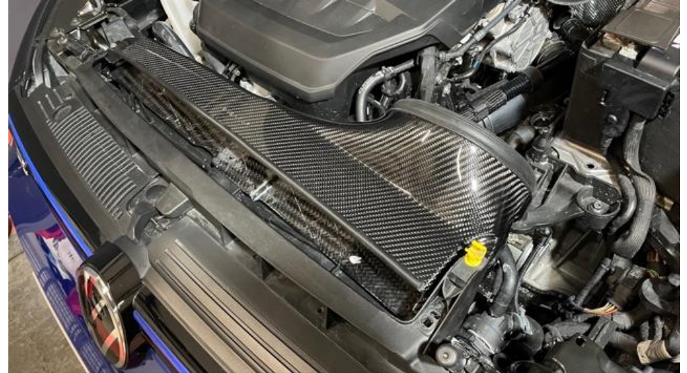
18. Place the new duct into position. The coolant hose goes UNDER the duct – see next step.