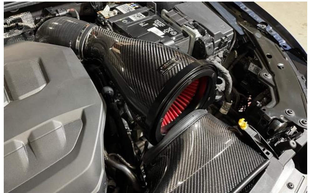
20. Push the filter housing into the silicon hose and lower it into place.