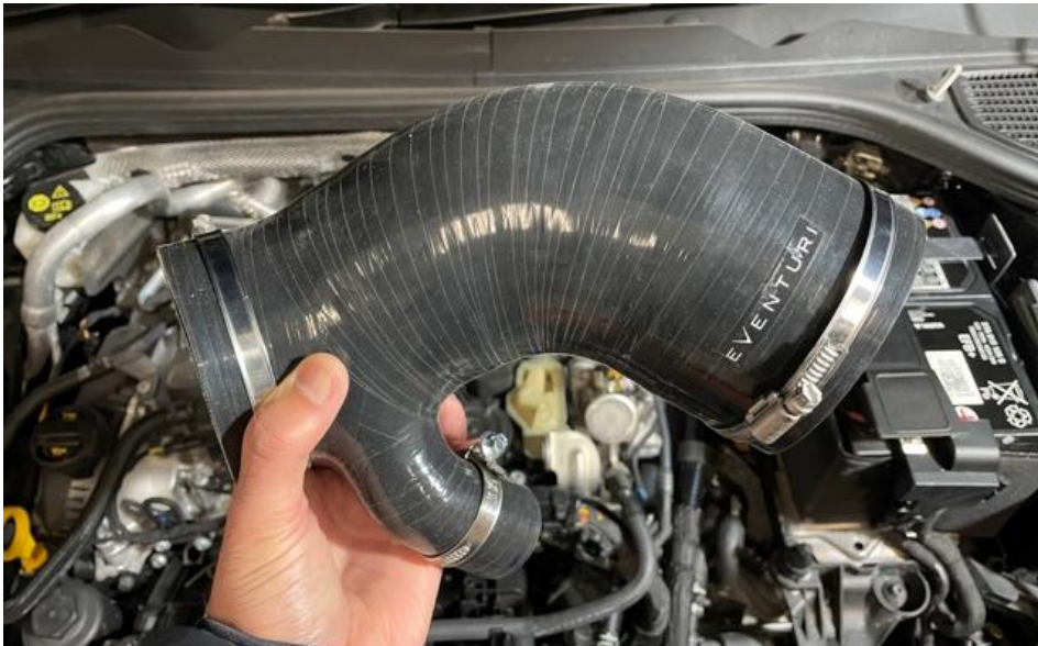
9. Take the new silicon with the hose clamp on each end. Golf R version shown.