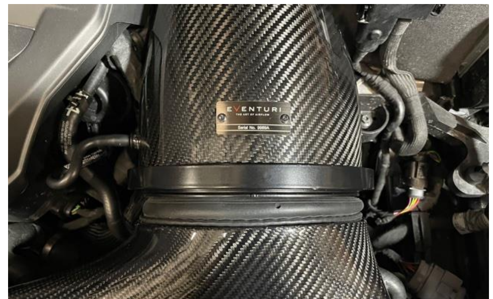
24. Filter housing should sit squarely with the duct. If it does not – the rear silicon needs to be rotated accordingly.