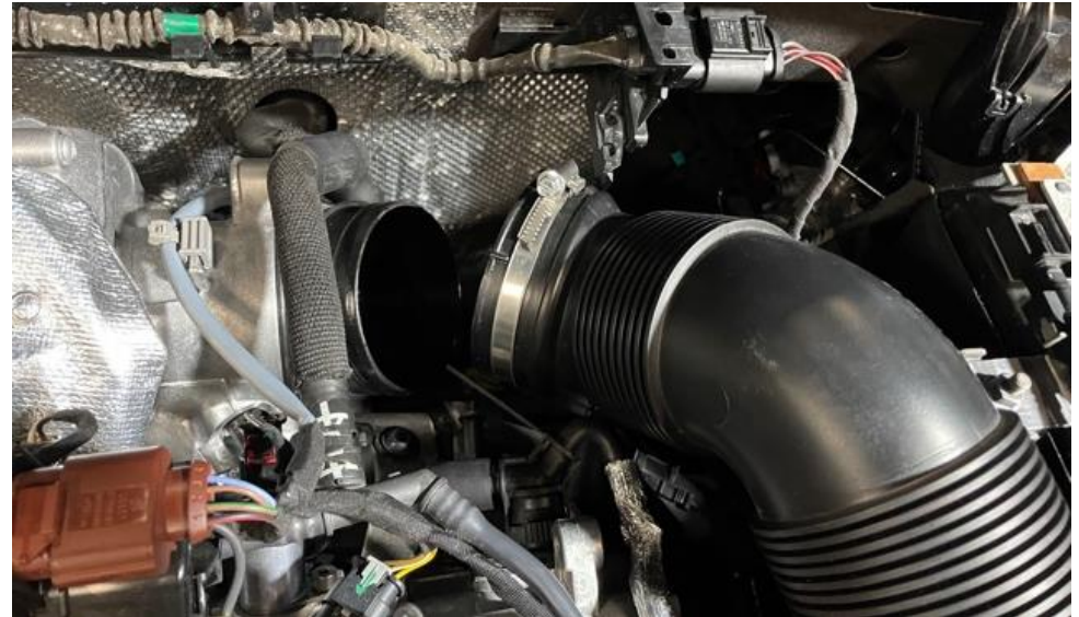
6. Remove the intake tube from the turbo inlet. (Golf R version shown)