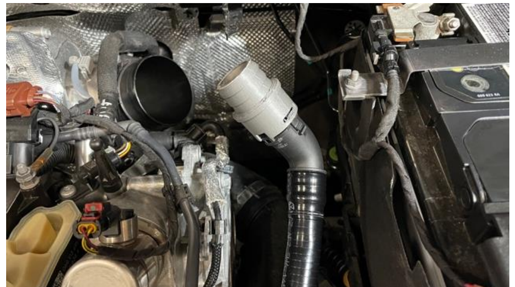
12. For the Golf R – take the machined adapter and clip it onto the bypass tube which was removed in step 7.