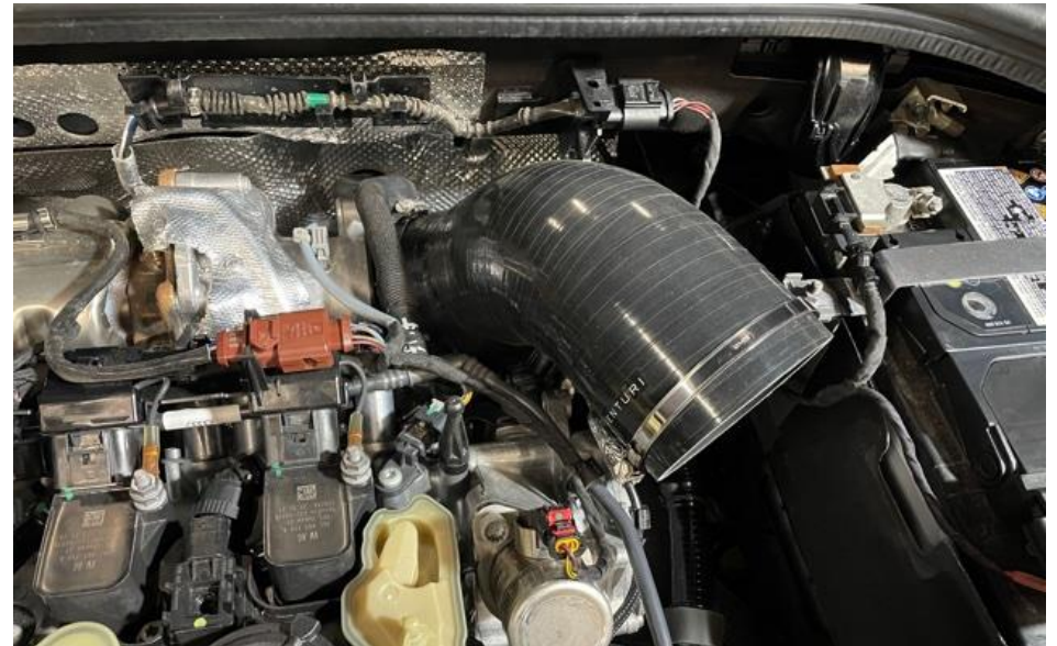
10. Install the silicon onto the turbo inlet.