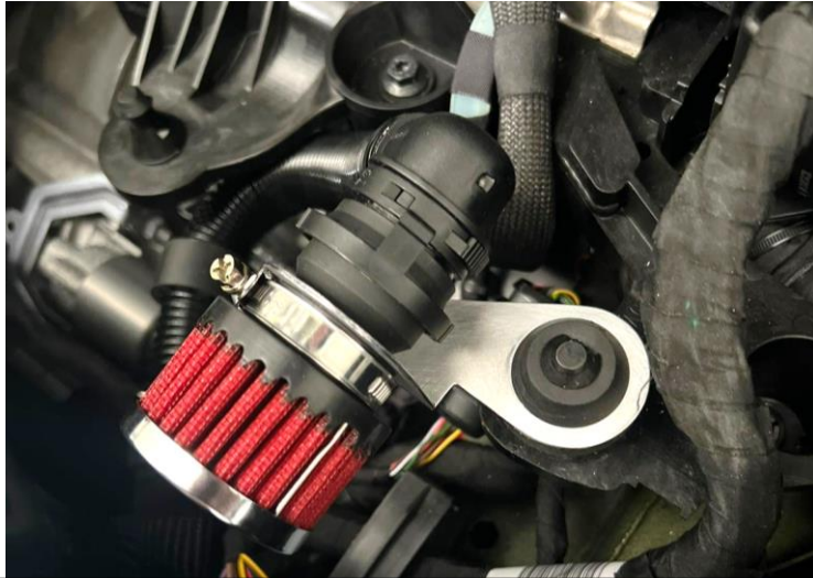
17. USA Golf Gti Only : Secure the bracket (grommet side) onto the airbox mount. Push down to secure.