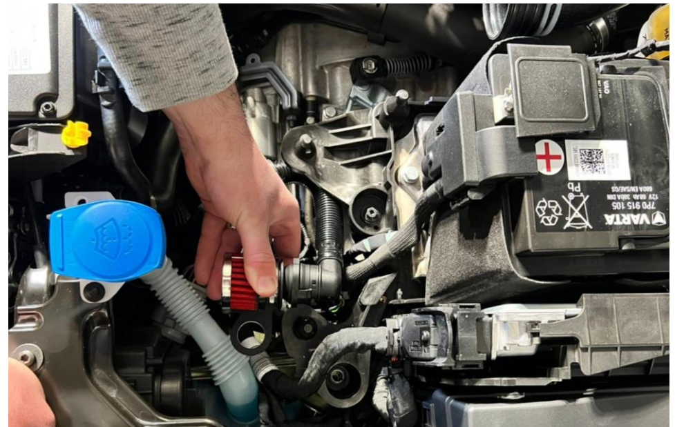
16. USA Golf Gti Only :Route the secondary breather tube under the airbox mounting tray as shown and push into the filter assembly.