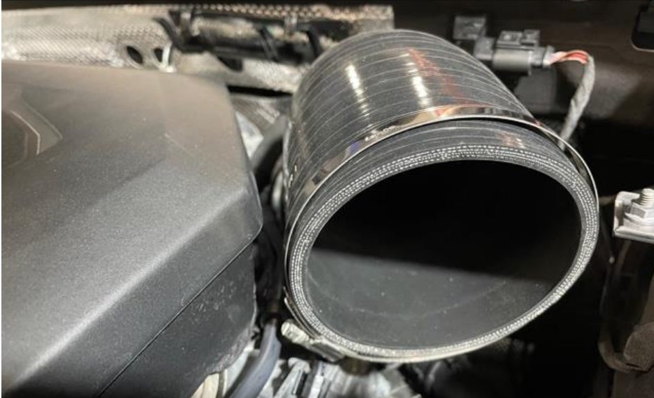
11. Place the engine cover back and rotate the hose to be almost touching the cover. Now tighten the clamp at the turbo side.