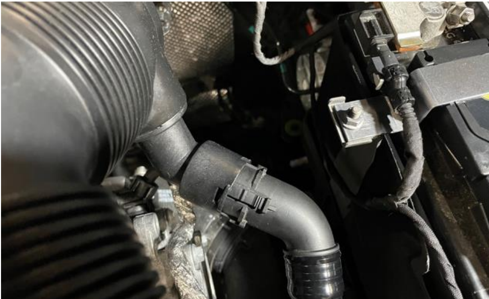
7. The Golf R has a secondary tube attached to the intake tube. Unclip and remove this from the intake tube.