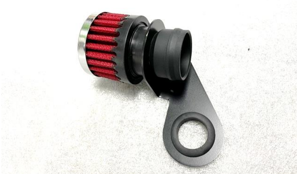
15. USA Golf Gti Only : Push the adapter through the bracket and then push the filter onto it from the other side as shown.