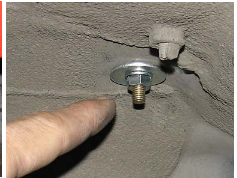
The flange nut and fender washer is fastened to the vibra-mount stud.