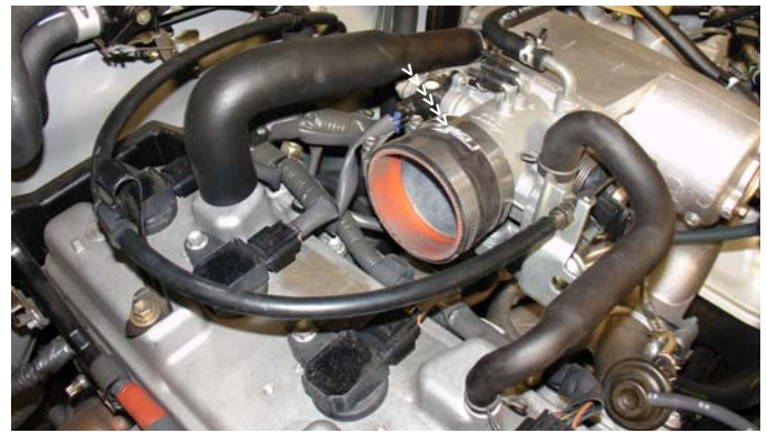
Press the 2 3/4" straight hose over the throttle body and use two power-bands. At this point, you will only tighten the band on the throttle body side.