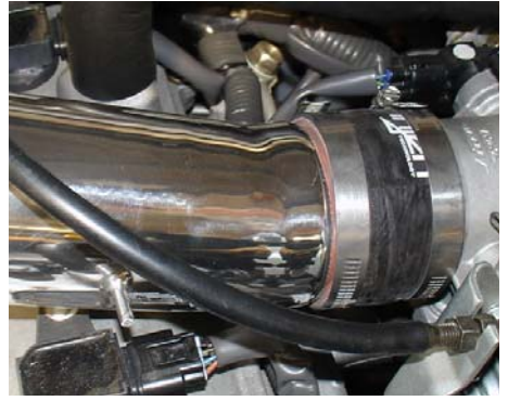
The intake is inserted into the throttle body hose and the intake bracket is lined up to the vibra-mount stud.