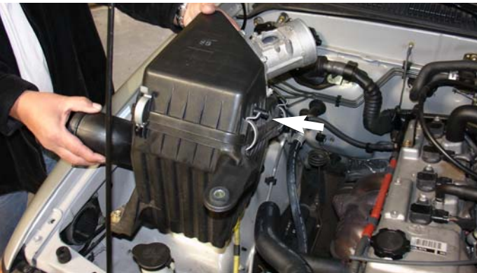
Remove the m6 bolts holding the air intake box to the fender well and the vacuum hose connected to the air box. Pull the air intake box out of the engine compartment.