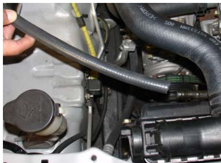
The 14"-10mm hose is pressed over the charcoal canister hard pipe.