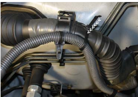
Use the zip tie to secure the sensor harness to the ECU main harness as shown above.