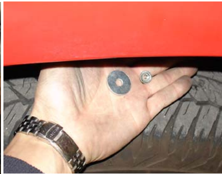
Go underneath the fender well, take the m6 flange nut and fender washer and secure the vibra-mount to the fender well.