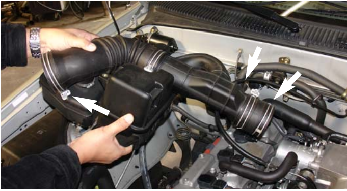
Loosen the clamps on the air intake box and the throttle body, remove the vacuum hose attached to the intake inlet and then continue to remove the air intake duct as shown above.