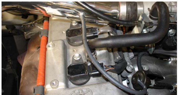
A good shot of the 4mm line connected to the pressure fuel regulator and the 3/16" intake port.