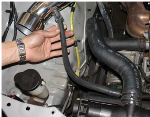
The 14"- 10mm vacuum hose is now pressed over the 1/2" intake port as shown above.