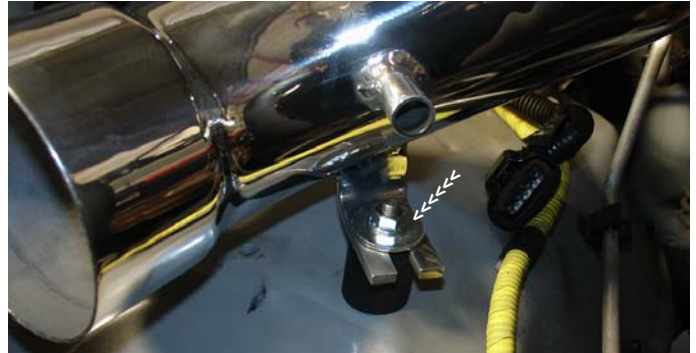
The flange nut and fender washer is screwed onto the vibra-mount stud. Do not over-tighten the flange nut at this point until the filter has been placed on the end.