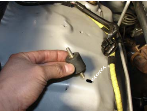
Insert vibra-mount into the pre-drill hole located on the fender well.