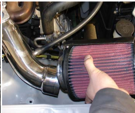
The 3 1/2" inverted top filter is set in the engine compartment ready to be installed.