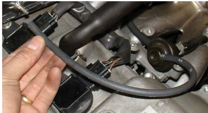
The stock 4mm pressure fuel regulator line is now pressed onto the 3/16" intake port.