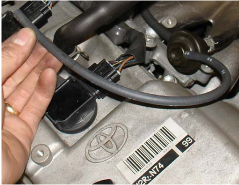
The stock 4mm hose remains on the pressure fuel regulator.