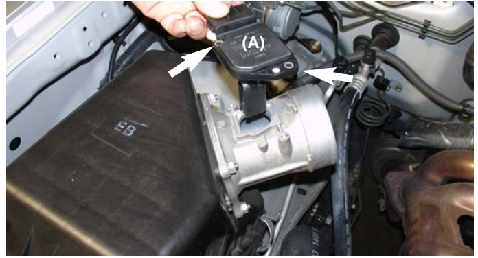
Remove the screws from the mass air flow sensor (A) and carefully pull the air sensor out of the sensor housing.