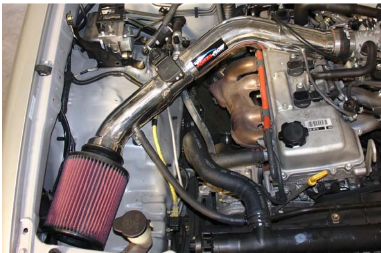
The new Hydro-shield By Injen