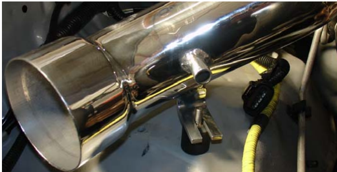
The intake bracket is sitting flush over the vibra-mount stud and lined up to the throttle body.