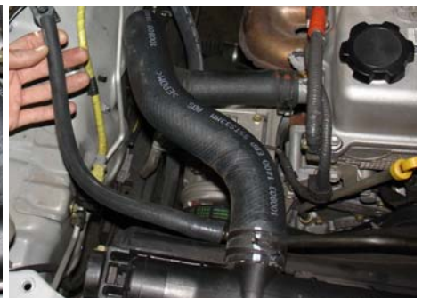
The 14"-10mm vacuum hose is now connected to the charcoal canister hard pipe.