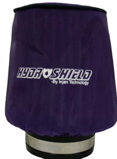
Hydro Shield Sold Separately

Now available, Hydro Shield by Injen Part Number X-1033