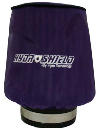
Hydro Shield Sold Separately

Now available, Hydro Shield by Injen Part Number X-1033