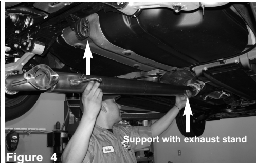
Figure 4 Position the Injen Mid-Y pipe into position. Place the mid hanger onto the grommet. Make sure you support the front of the exhaust pipe with a exhaust stand.