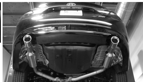
Figure 8 Make sure nothing comes into contact with any component and then make your final adjustments to the entire exhaust system. Use a 14mm socket and ratchet secure all the M10 nuts and bolts. Congratulations! You have just completed the installation of the Injen Cat-back system. Periodically, check the alignment of the exhaust, normal heat cycles can cause nuts and bolts to come loose. Failure to check the alignment and adjust the exhaust can cause damage that will void the warranty.