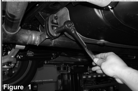
Figure 1 Use a 12mm socket and ratchet to remove the 12mm bolt on the center hanger located near the stock exhaust "Y" section.