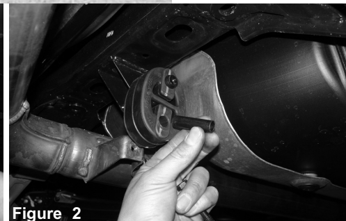
Figure 2 Pull the spacer out of the exhaust grommet from figure 1