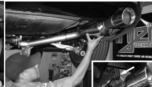
Figure 6 Once the mid-pipe is in place. Position the right side muffler section into the right side bumper cavity and then hang the muffler on the grommet.