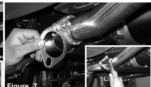
Figure 7 Place one supplied 60mm gasket and two M10 nuts and bolts connecting the right side muffler section flange to the mid-pipe flange. Use a 14mm ratchet and socket to snug the two M14 nuts and bolts for now. Do not tighten them. Repeat this process for the left side muffler section.