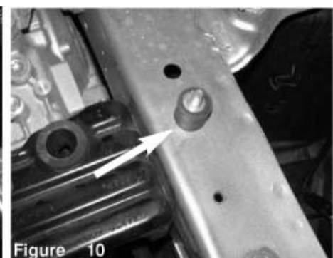
Figure 10 Secure and tighten the vibra mount.