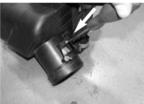
Figure 12 With T20 torx bit, loosen and remove the 2 screws holding in MAF sensor.