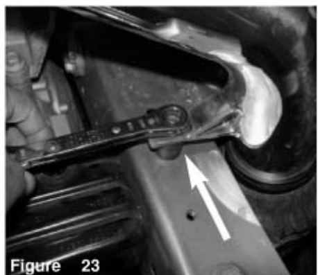
Figure 23 tighten the vibra mount using 13mm socket or wrench .