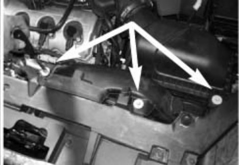
Figure 4 Loosen the 3 screws holding in the air box using 8mm nut driver or socket.