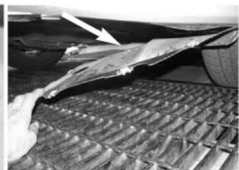
Figure 14 loosen the screws holding in the front driver side splash guard. This will allow for the filter installation into the bumper compartment.