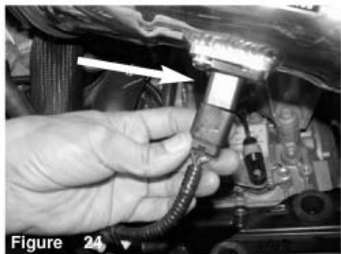
Figure 24 Re-connect the MAF sensor harness.