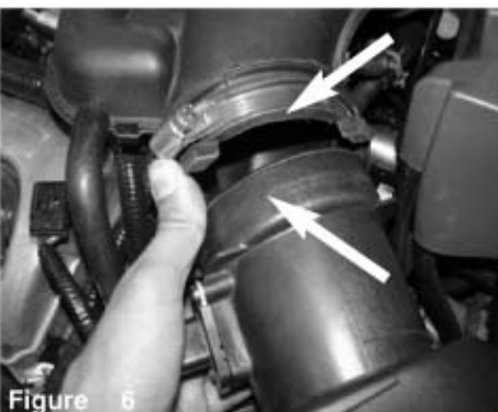
Figure 6 Now pull back the stock intake tube away from the air box.