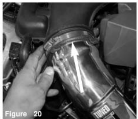
Figure 20 Now attach the intake tube to the stock intake hose. Do not tighten.