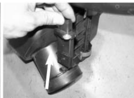
Figure 13 Carefully remove MAF sensor from air box.