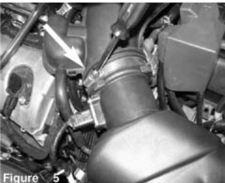
Figure 5 Loosen the clamp on the air box.