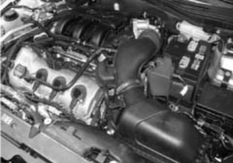
Figure 2 Complete stock air intake cleaner and air intake duct.