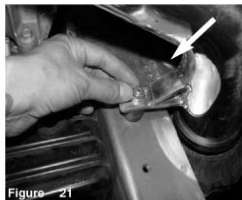
Figure 21 Secure the bracket using provided nut and washer.