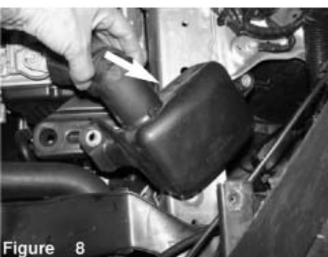
Figure 8 Remove the resonator from the frame of vehicle located under the headlight. Loosen the 2 nuts holding in the resonator using 12mm socket or wrench.