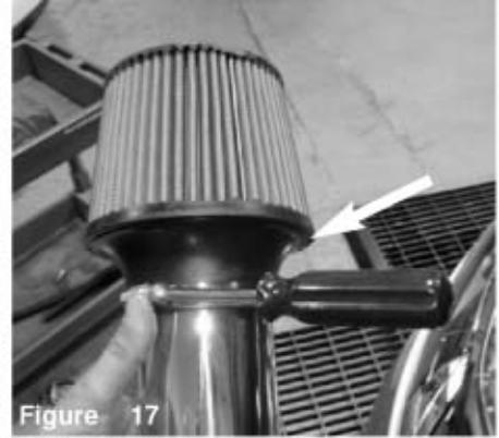
Figure 17 Install the filter to the tube and tighten using 8mm nut driver.