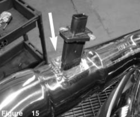
Figure 15 Install the MAF sensor into new intake tube.