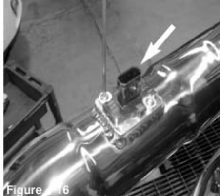
Figure 16 Secure and tighten the MAF sensor using provided M4 button head screws using 2.5mm allen key.