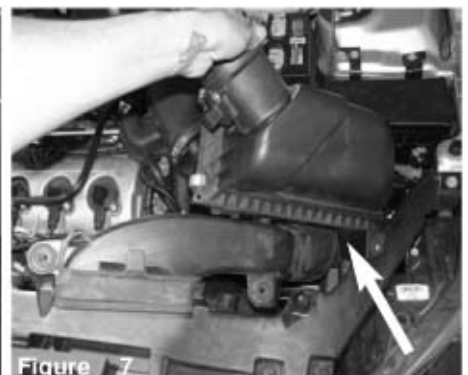
Figure 7 Lift up and remove the air box assembly from the vehicle, make sure the fitting pop out from grommets under neath air box.