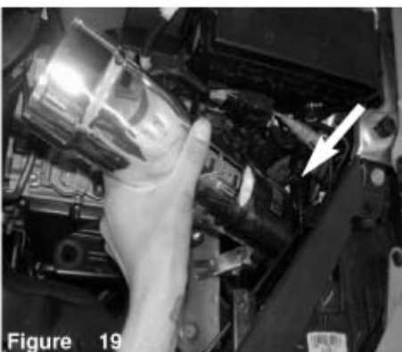
Figure 19 Now lift up and position the tube to the factory intake hose.