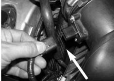
Figure 3 Disconnect the MAF sensor harness.