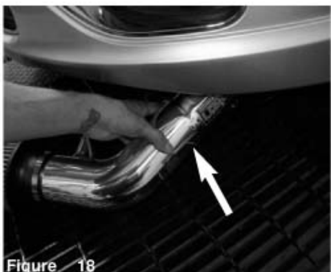
Figure 18 Pull splash guard back, and install the intake assembly into vehicle and position the intake through bumper cover.