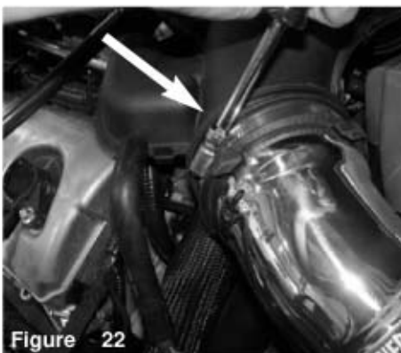
Figure 22 Position for the best fit, tighten the clamp using 8mm nut driver.