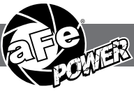
Pro DRY S Air Filter