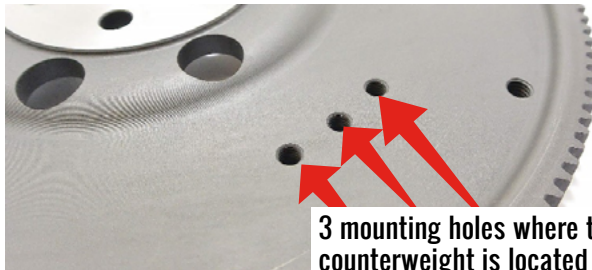
3 mounting holes where the counterweight is located