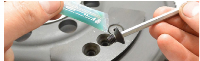
Using a thread locking compound fit the 3 counter sunk headed bolts (as supplied) and torque to 35Nm

If you are unsure of which counterweight to use refer to your engine builder/supplier or contact the technical service team at Australian Clutch Services (1800 CLUTCH)