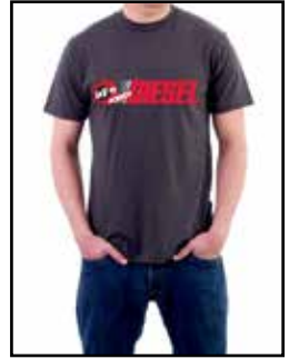
aFe Power Diesel T-Shirt

P/N: 40-30222-G (L) P/N: 40-30223-G (XL) P/N: 40-30223-G (2XL) P/N: 40-30223-G (3XL)