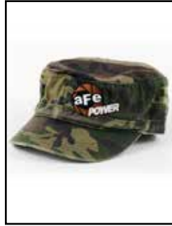
aFe Power Ladies Hat

P/N: 40-10114 (S/M) P/N: 40-10115 (L/XL)