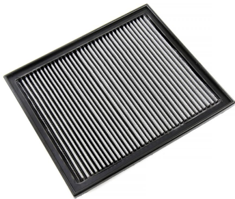
HPS Performance Drop-In Air Filter