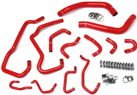
HPS Silicone Radiator + Heater Coolant Hose Kit