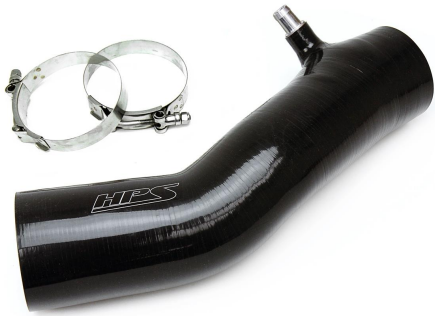
HPS Silicone Air Intake Hose Kit