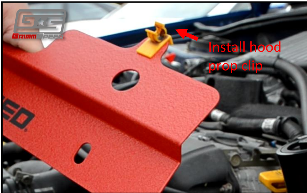
Figure 7: Install hood prop clip