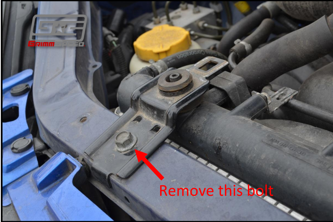
Figure 4: Remove OEM radiator stay brackets