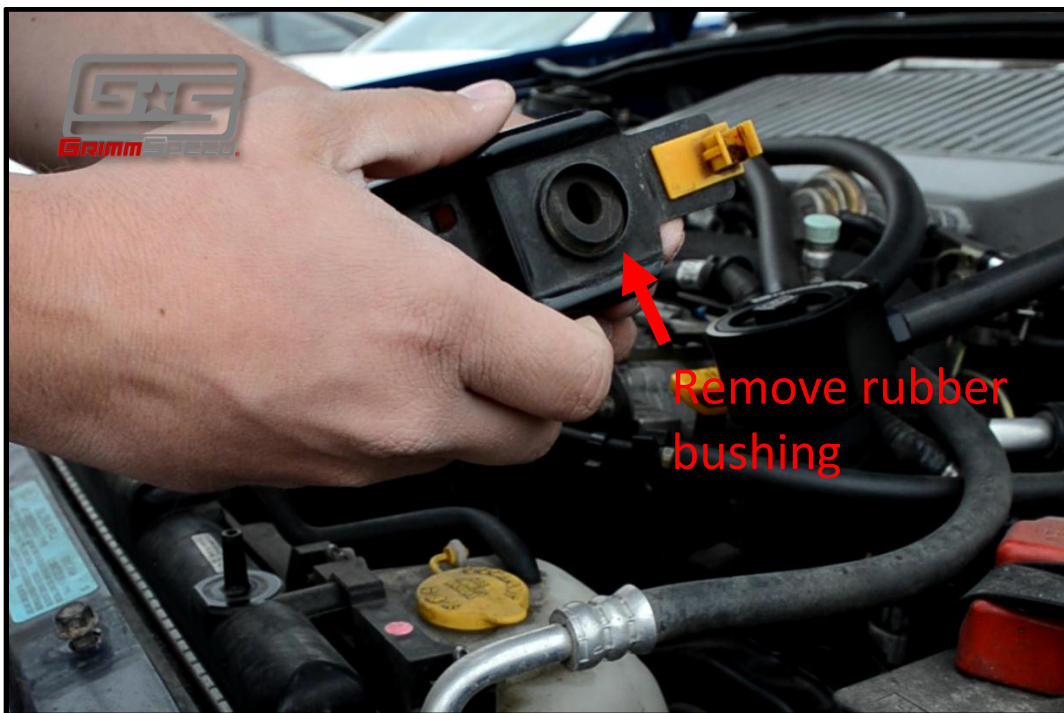
Figure 5: Removing rubber bushings