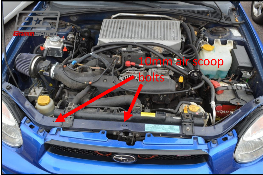
Figure 2: Air scoop bolt locations