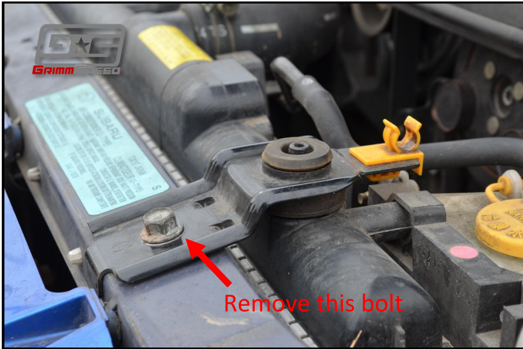
Figure 3: Remove OEM radiator stay brackets