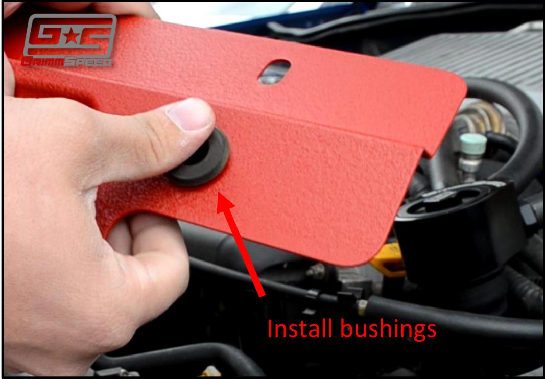
Figure 8: Install rubber bushings