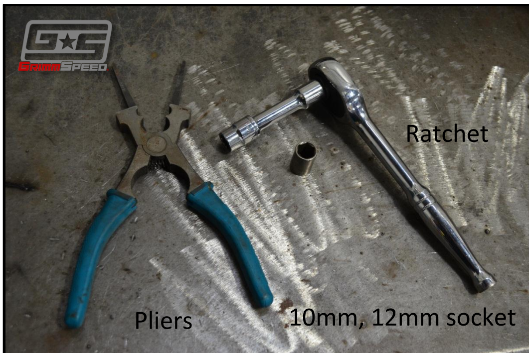
Figure 1: Tools

Tips: Using an extension will help give you more space to spin the ratchet and avoid damaging your radiator shroud.